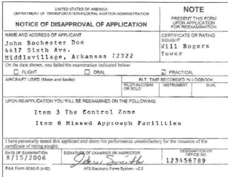
Figure, H-1, Sample FAA Form 8060-5, Notice of Disapproval of Application