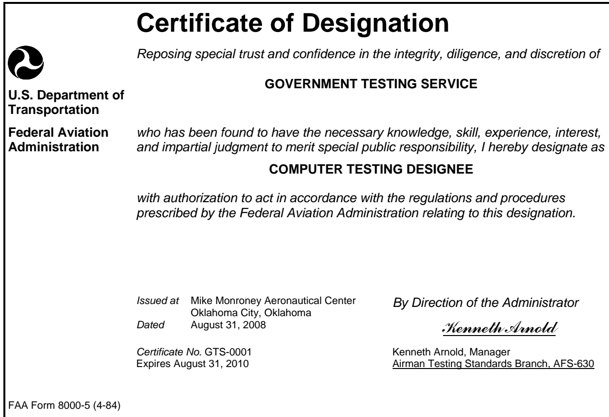
Figure 8. Sample FAA Form 8000-5, Certificate of Designation