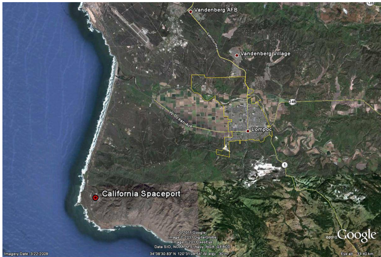
Exhibit 4-1. Location of the California Spaceport at VAFB

The California Spaceport is located on VAFB along the Pacific Ocean in western Santa Barbara County, California (see Exhibits 4-1 and 4-2). The base is a 99,000-acre military facility approximately 150 miles northwest of Los Angeles, California. VAFB is the third largest USAF installation and is operated by the 30 th Space Wing of the USAF with the principal mission to conduct and support space and missile launches. The cities of Lompoc and Santa Maria (located 7 miles southeast and 17 miles northeast of VAFB, respectively), make up the two main urban areas in the region near VAFB and support a small number of industrial areas and small airports. VAFB occupies an ecological transition zone between the cool, moist conditions of coastal northern California and the semi-desert conditions of southern California. Approximately 60 percent of the base consists of open space and recreation area. An additional 30 percent is used for grazing and other forms of agriculture, and the remaining 10 percent of the base consists of facilities and operations associated with USAF activities.