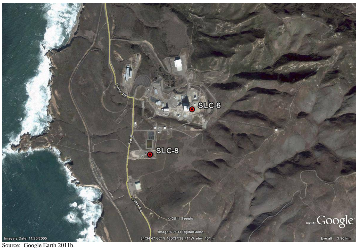
Exhibit 4-2. SLC-6 and SLC-8 at VAFB

Section 4.1 below summarizes the affected environment as presented in the 1995 EA. Sections 4.2 through 4.8 provide updates to the existing conditions for air quality; biological resources; historical, architectural, archaeological, and cultural resources; Department of Transportation Act Section 4(f) properties; light emissions and visual resources; noise; and socioeconomics, environmental justice, and children's environmental health and safety. The 1995 EA, along with the updated information presented in Sections 4.2 through 4.8, is considered a valid discussion of the affected environment for the Proposed Action.