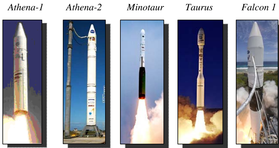
Exhibit 2-2. Photos of Proposed Launch Vehicles 1

Sections 2.1.1.1 through 2.1.2.2 provide a brief description of each of the launch vehicles.