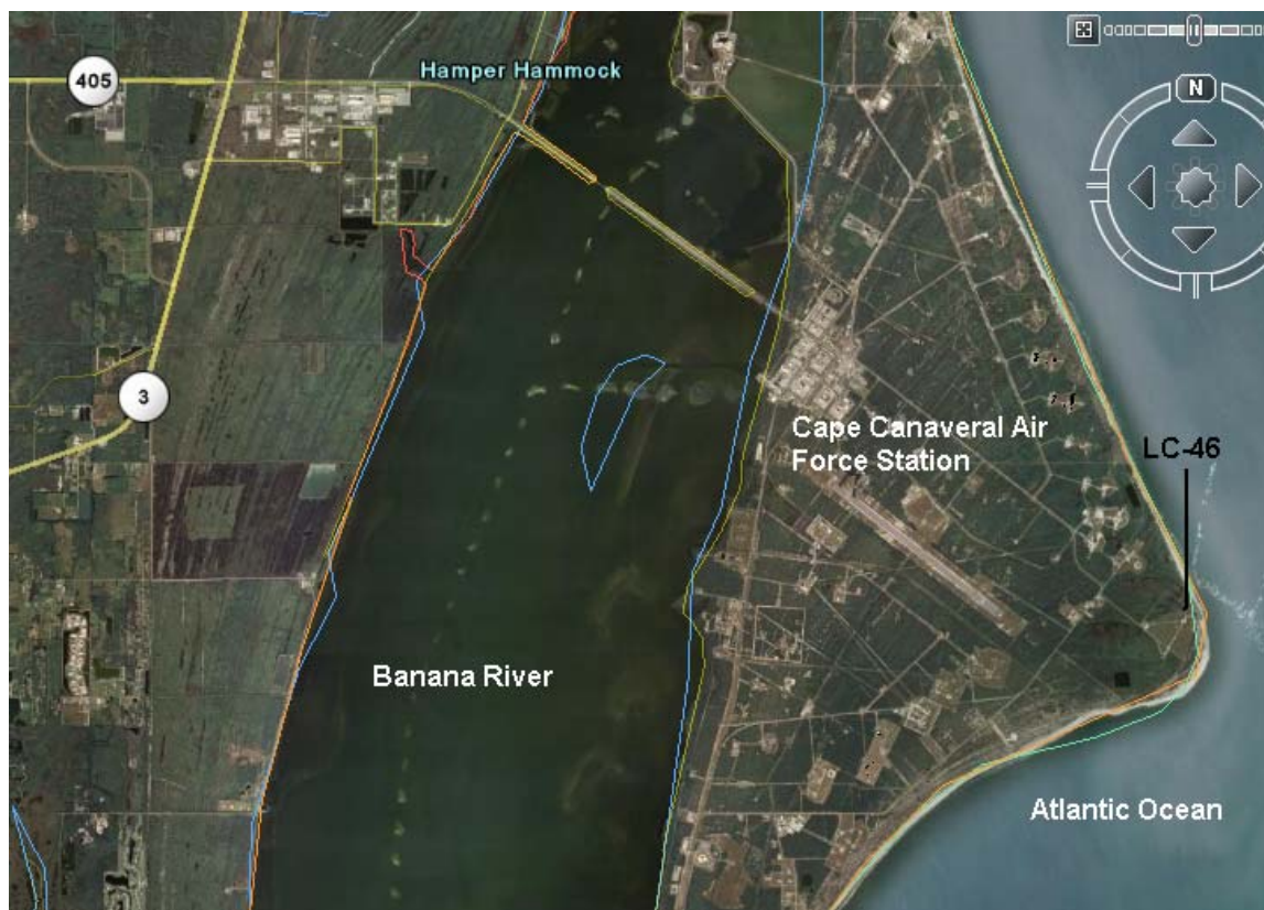
Exhibit 2-1. Map of Cape Canaveral Air Force Station and Surrounding Areas

Under the Proposed Action, Space Florida would offer the launch site to launch operators for several types of vertical launch vehicles, including Athena-1 and Athena-2, Minotaur, Taurus, Falcon 1, Alliant Techsystems small launch vehicles (AKT SLV), and launches of other Castor® 120-based or Minuteman-derivative booster vehicles. Space Florida proposes to support a maximum of 24 annual launches, including 12 solid propellant launches and 12 liquid propellant launches. The proposed launch vehicles and their payloads would be launched into low earth orbit or geostationary orbit. All vehicles are expected to carry payloads, including satellites.