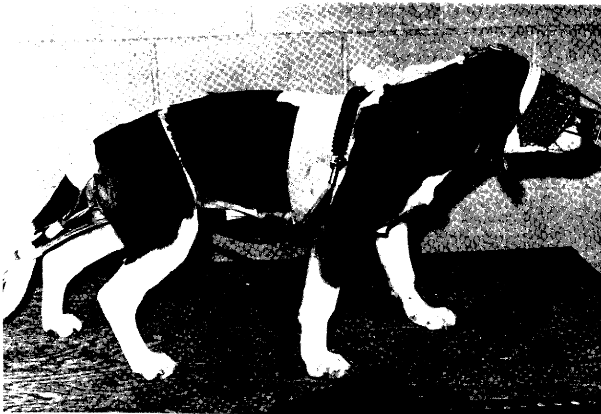
Figure 2. Shows dog prepared for monitoring rectal temperature, heart rate, and respiration rate. Dogs were able to move about freely inside test crate during exposure to cold air temperature.

In the room outside the environmental test chamber, baseline data were obtained on the dogs for rectal temperature (Tre), heart rate (HR), respiration rate (RR), and behavior (barking and excessive movement) for 45 minutes. At the same time, air temperature and humidity were monitored for the test crate inside the cold chamber to determine the crate's micro-environment with dog absent. Starting at 10:00 a.m. regularly, dogs were hand-carried into the environmental chamber and placed in the pre-chilled test crate. During cold exposure the dogs continued to be monitored for the Tre, HR, and RR using noninvasive methods (Figure 2). 5 Both barking and excessive movement were