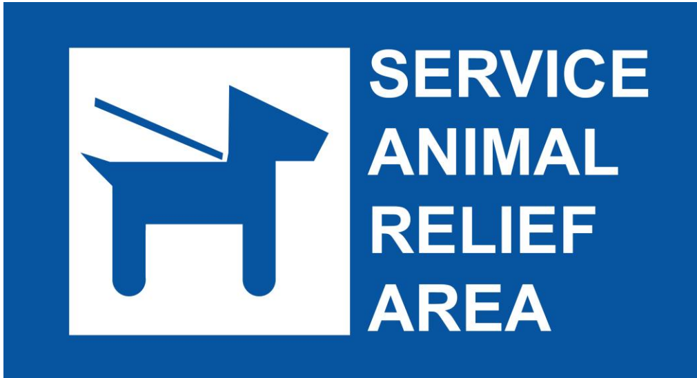
Figure A-2. Example SARA Signage