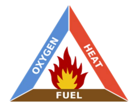
Figure A-1. Fire Triangle