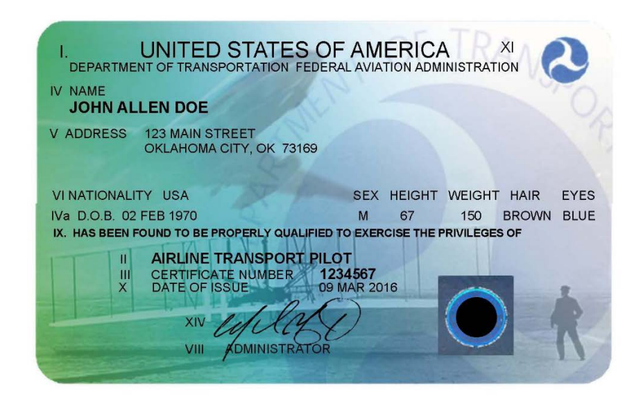
Figure 1. Sample Superseded Airman Certificate with Hole-Punched FAA Holograph