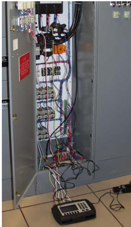
Figure A-1. Dranetz Connection

(2) Set the LDA to capture voltage disturbances on all phases as follows: