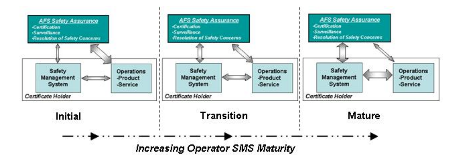
Figure 3-2. Evolution of FAA and Organization Certificate Holder's Roles

f. Evolution of SMS Function. As illustrated in Figure 3-2, as the SMS becomes more established, FAA oversight concentrates less on traditional surveillance and regulatory compliance inspections, such as directly examining certificate holder products and services, and more on assessing and evaluating the certificate holder's SMS; which plays an ever-increasing role in the organization's safety capability. Direct observation/surveillance changes from a goal in itself to a quality assurance verification of a certificate holder's SMS functions.