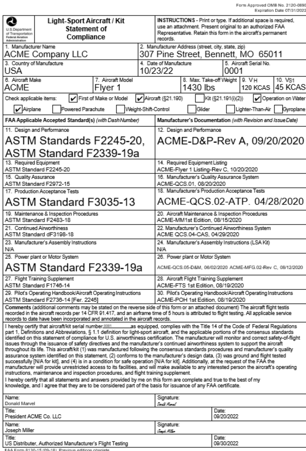
Figure A-7. Sample FAA Form 8130-15, Light-Sport Aircraft Statement of Compliance

FAA Form 8130-15 (09-18) Previous editions obsolete