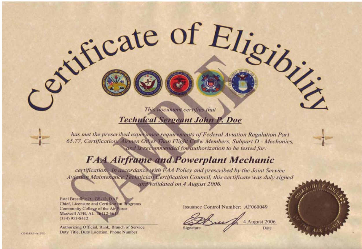
Figure A-6. Certificate of Eligibility (FAA Order 8900.1, Volume 5, Chapter 5, Section 2, Figure 5-137)