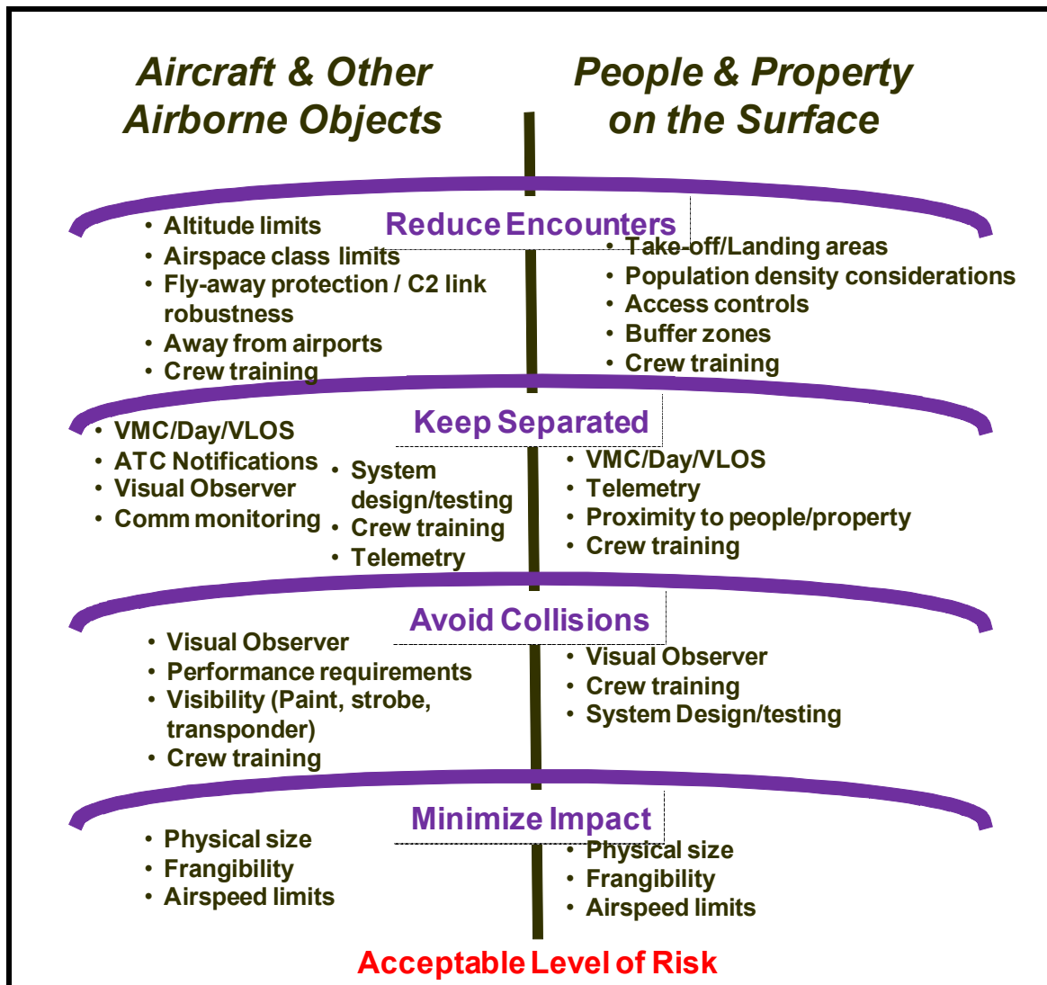
Figure 1. Layered Approach for Ensuring Safety