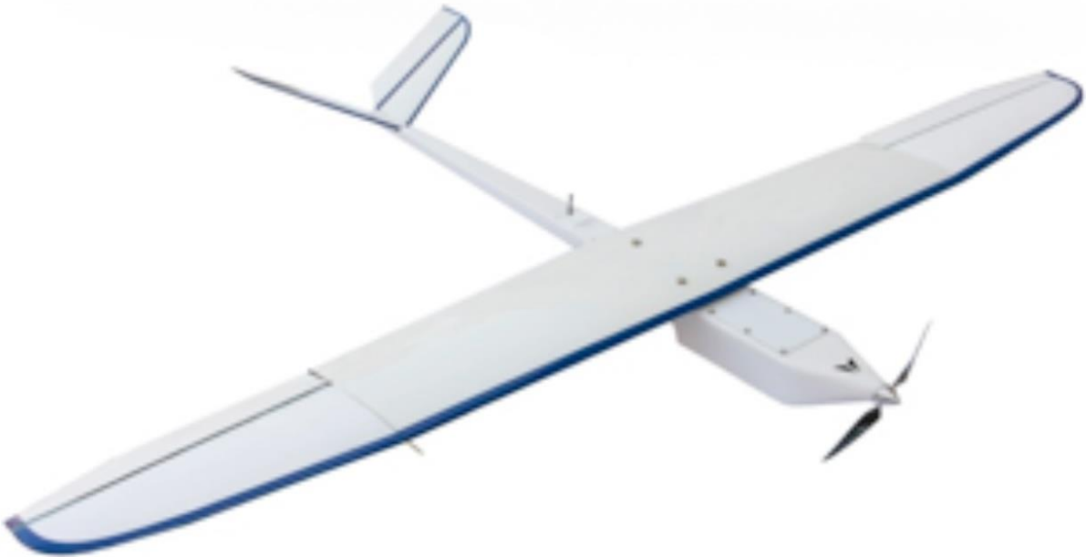
Figure 1: The Nova F6500 UA.

Altavian seeks an exemption to operate the Altavian Nova F6500 UAS (also known as the Nova Block III UAS), Serial No. 3016, registration number N6682B 2 , for compensation or hire within the national airspace system (“NAS”). The Nova F6500 UAS is comprised of an amphibious unmanned aircraft (UA) and a transportable ground control station. The Nova F6500 UA has a maximum gross weight of approximately fifteen (15) pounds, while having a wingspan of 108 inches and a length of 65 inches. The Nova F6500 UA is equipped with a single propeller driven by a Lithium Polymer battery powered electric motor.