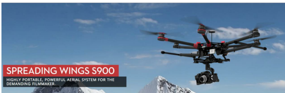
Unmanned Aircraft System DJI S900