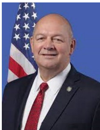
Stephen M. Dickson: Eighteenth Federal Aviation Administration Administrator (August 12, 2019 – March 31, 2022), appointed by President Donald J. Trump

During his tenure, Huerta has worked to redefine the FAA's regulatory relationship with the aviation industry to achieve greater levels of safety through increased collaboration and widespread sharing of data. He also has led the agency's efforts to modernize the nation's air traffic control system through the next generation air transportation system (NextGen) program while preparing the way for the safe integration of commercial space operations and small unmanned aircraft systems (UAS). Since the beginning of his term, the FAA has completed key building blocks of NextGen, including the installation of modern information systems to serve as the backbone for future technological improvements. The FAA also completed the installation of a comprehensive network of ground-based radio stations that enable the use of global positioning satellites (GPS) instead of radar to better manage air traffic. In addition, the agency has made significant progress in harnessing GPS technology to modernize thousands of air traffic routes in congested airspace.