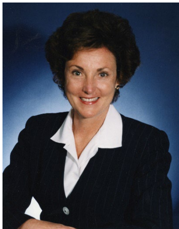
Jane F. Garvey: Fourteenth Federal Aviation Administrator (August 4, 1997 - August 2, 2002), appointed by President William J. Clinton

After leaving the FAA, Hinson became chairman of International Aerospace Solutions, an aviation consulting firm, and served on the board of directors of the Smithsonian National Air and Space Museum in Washington, D.C.