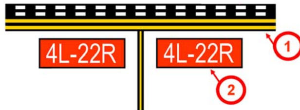
Figure 3. Enhanced Airport Surface Markings Evaluated at BOS.

proposals, the numbers refer to the marking descriptions in the introduction section. Ninety-seven pilots completed surveys after having seen the enhanced markings. Seventy-four of them compared the enhanced markings at BOS with the current marking standard. The other 23 pilots compared the enhanced markings at BOS with the enhanced markings at PVD (see above). A majority of the pilots preferred the enhanced markings over the current markings. Whereas the modification of the hold-short line (white dashes and holdline extended onto the shoulder) was evaluated similarly by pilots in BOS as well as in PVD, the markings that included a modified taxiway centerline (PVD) received overall higher evaluations than the markings without (BOS). In structured interviews pilots indicated that they saw the greatest benefits of enhanced markings for pilots who were unfamiliar with the airport but familiar with the marking enhancements, and who taxied in aircraft that allowed a direct view of the taxiway centerline ahead of them (as opposed to an aircraft with restricted forward visibility).