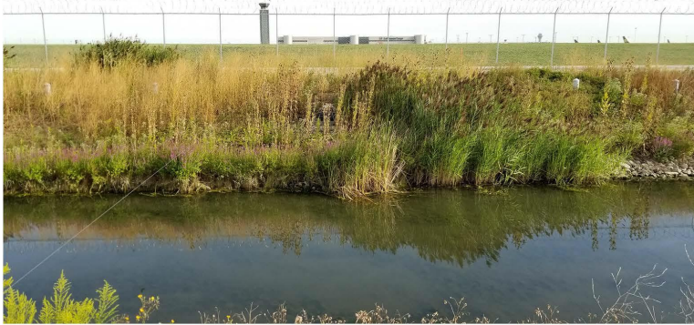
Photo 9. Bensenville Ditch - Section 2, General site, side culvert. View to the north