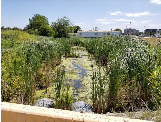
Photo 49. Ditch 10, General site, View to the east