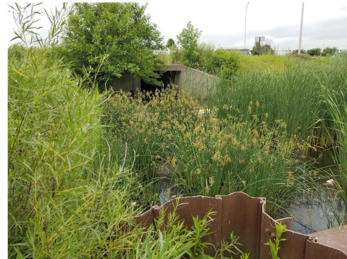
Photo 24. Crystal Creek - Section 4, General site, View to the north