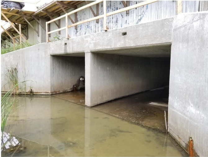
Photo 21. Crystal Creek - Section 4, Box culvert under I294. View to the east