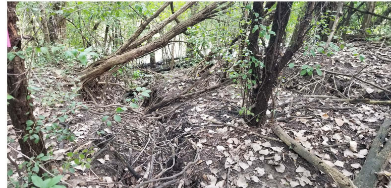
Photo 72. Ditch 20, Headcut erosion, View to the north