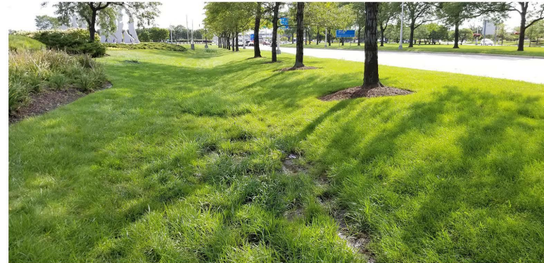
Photo 76. Ditch 22, General site, View to the east