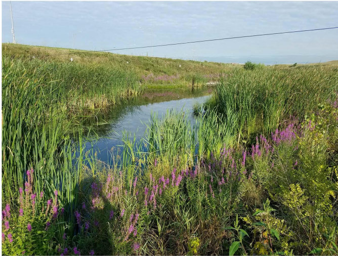
Photo 1. Bensenville Ditch - Section 1, General site