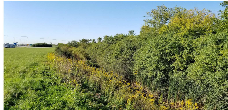
Photo 64. Ditch 14, General site, View to the south