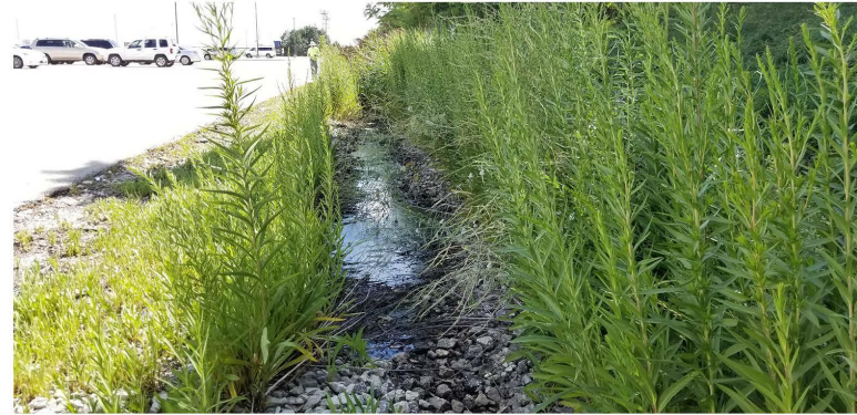
Photo 26. Ditch 01, General site, View to the south