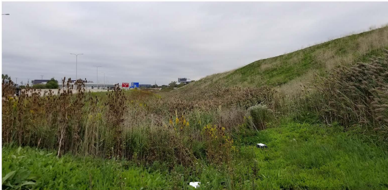
Photo 67. Ditch 17, General site, View to the north