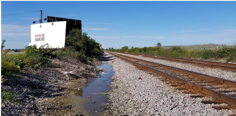
Photo 75. Ditch 21, General site, View to the north