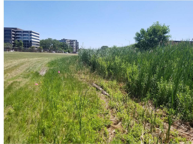
Photo 50. Ditch 11, General site, View to the east