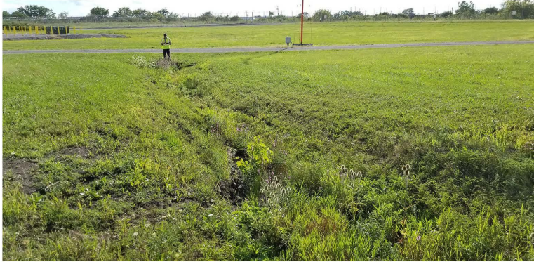
Photo 37. Ditch 05, Side ditch. View to the south