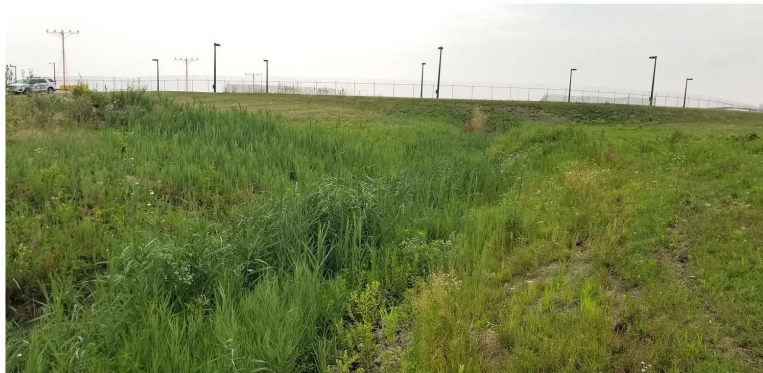
Photo 31. Ditch 03, General site, View to the east