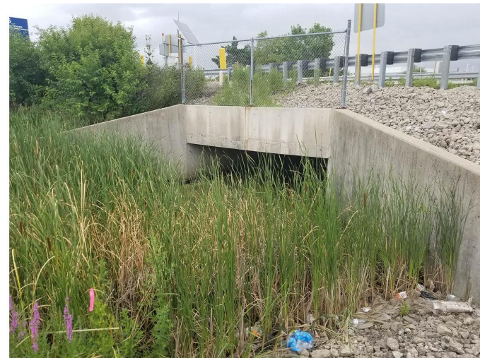
Photo 16. Crystal Creek - Section 2, General site, culvert exit. View to the southeast