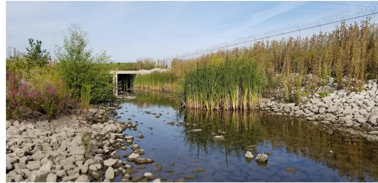
Photo 6. Bensenville Ditch - Section 2, General site, west end. View to the west