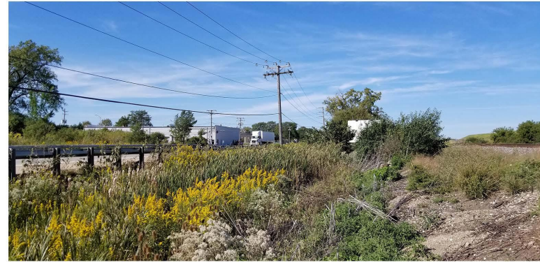
Photo 42. Ditch 08, General site, View to the north