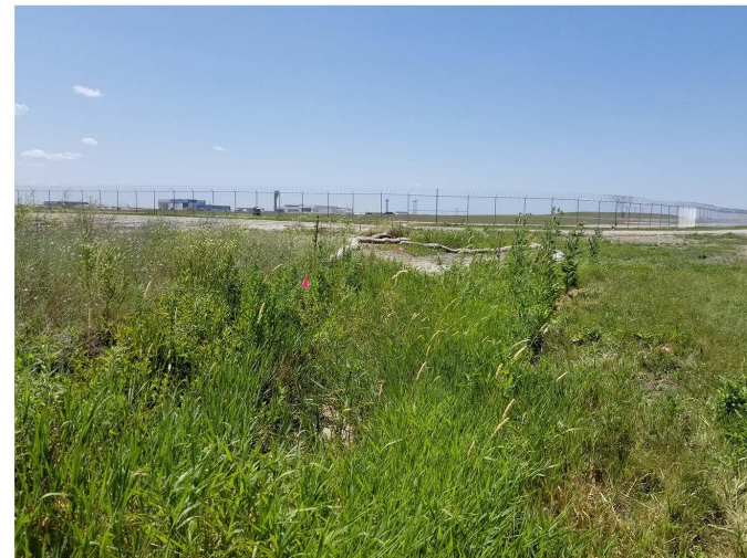
Photo 52. Ditch 11, General site, View to the west