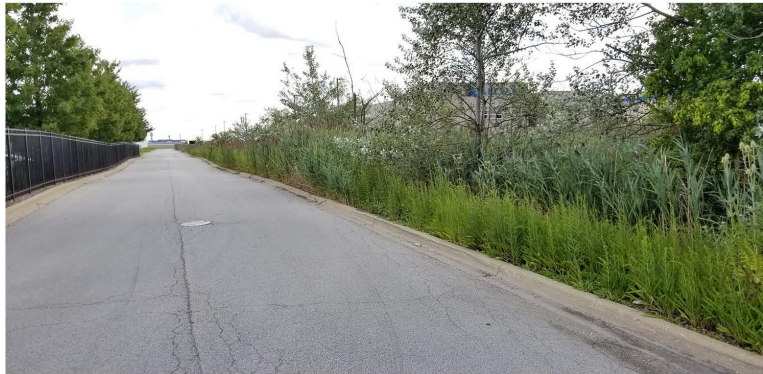
Photo 29. Ditch 02, General site, View to the south