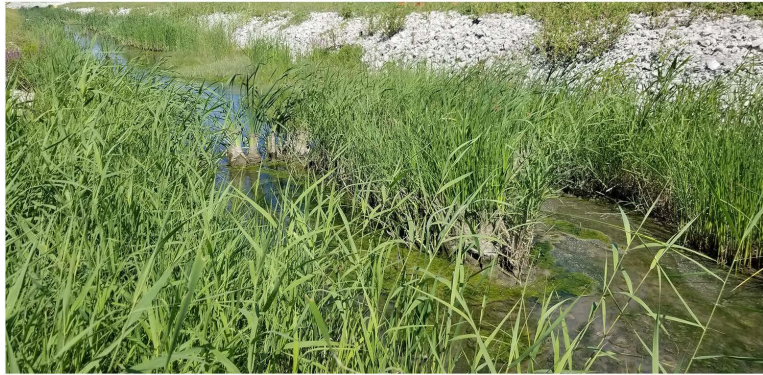
Photo 45. Ditch 09, Wracking