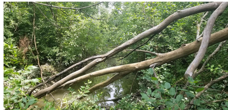
Photo 60. Ditch 13 - Section 2, General site, View to the north