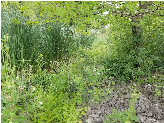
Photo 23. Crystal Creek - Section 4, General site, View to the south