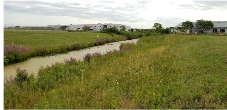
Photo 10. Crystal Creek - Section 1, General site, View to the south