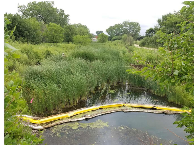
Photo 20. Crystal Creek - Section 4, General site, boom. View to the southeast