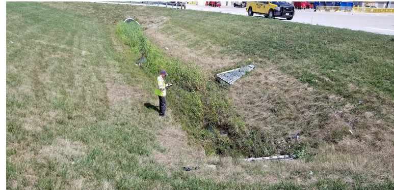
Photo 36. Ditch 04, General site, south section. View to the north