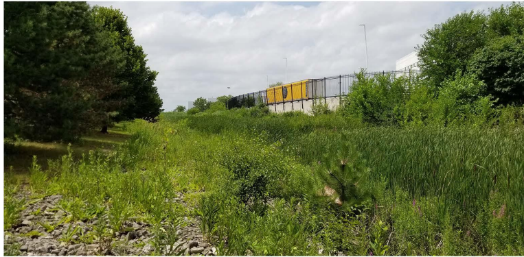
Photo 17. Crystal Creek - Section 3, General site, View to the north