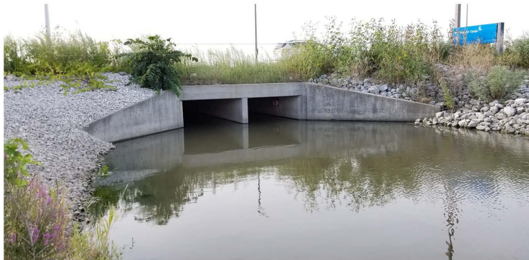
Photo 7. Bensenville Ditch - Section 2, East end, double culvert exit. View to the east