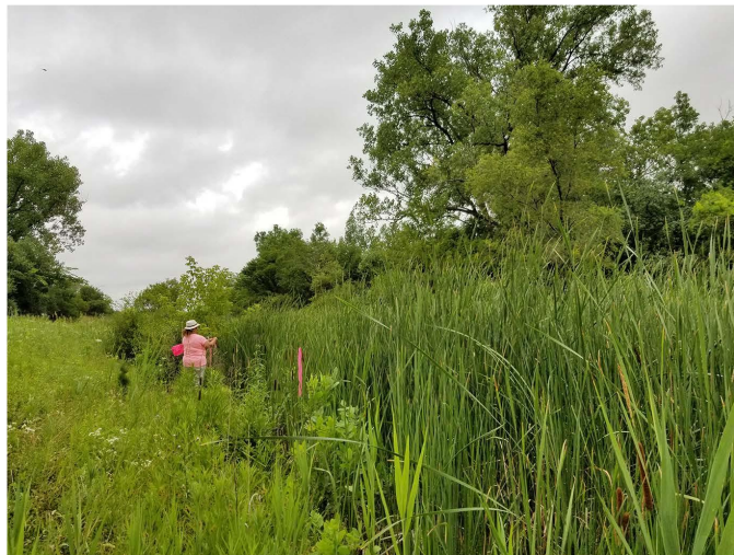
Photo 19. Crystal Creek - Section 4, General site, View to the north