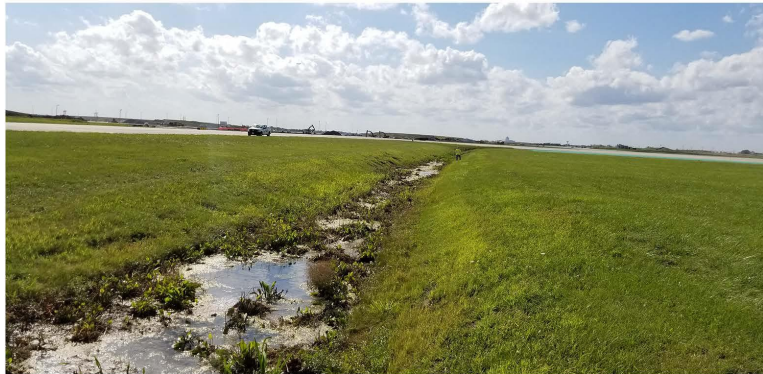
Photo 55. Ditch 12, General site, View to the west