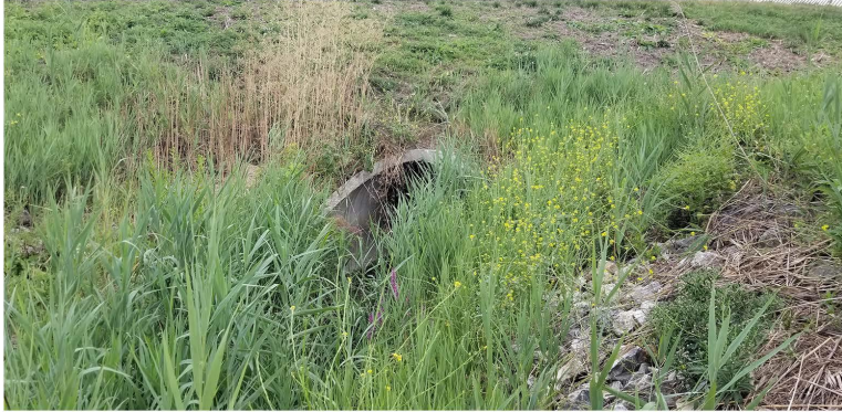
Photo 33. Ditch 03, East culvert