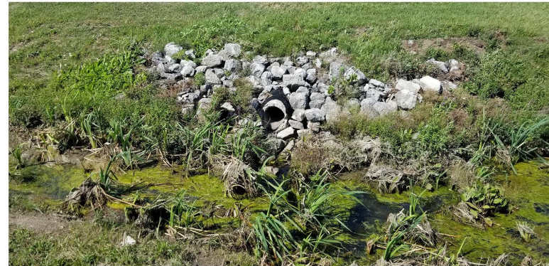
Photo 56. Ditch 12, General site, north culvert entrance. View to the north