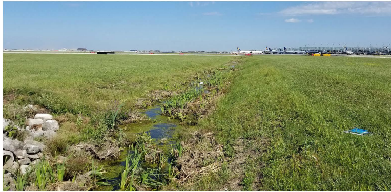
Photo 53. Ditch 12, General site, View to the east