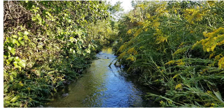
Photo 62. Ditch 14, General site, View to the north