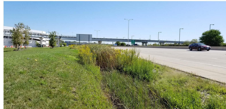
Photo 40. Ditch 07, General site, View to the south