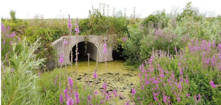
Photo 11. Crystal Creek - Section 1, General site, outfall. View to the north