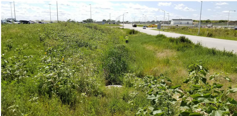
Photo 39. Ditch 06, General site, View to the southwest