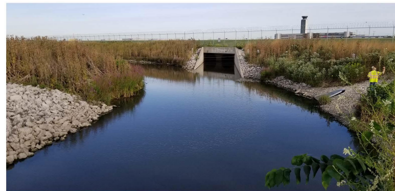
Photo 8. Bensenville Ditch - Section 2, East end, double culvert. View to the north