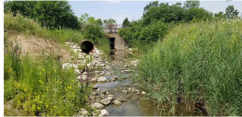
Photo 58. Ditch 13 - Section 2, General site, View to the west