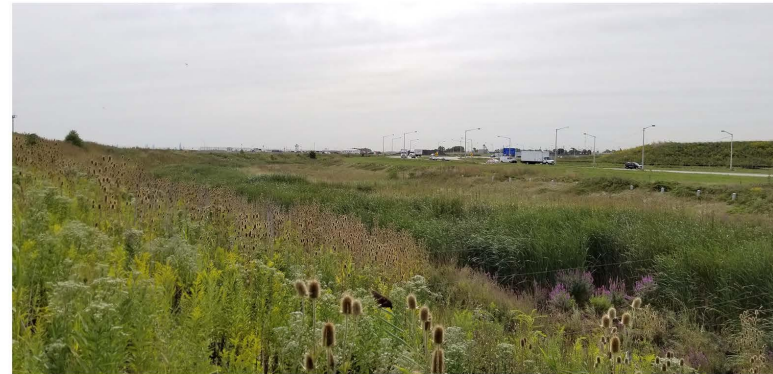
Photo 2. Bensenville Ditch - Section 1, General site, View to the southeast