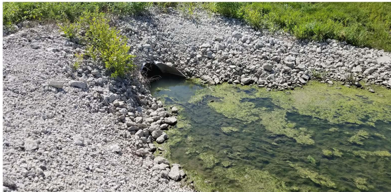
Photo 47. Ditch 09, Culvert in north section. View to the north