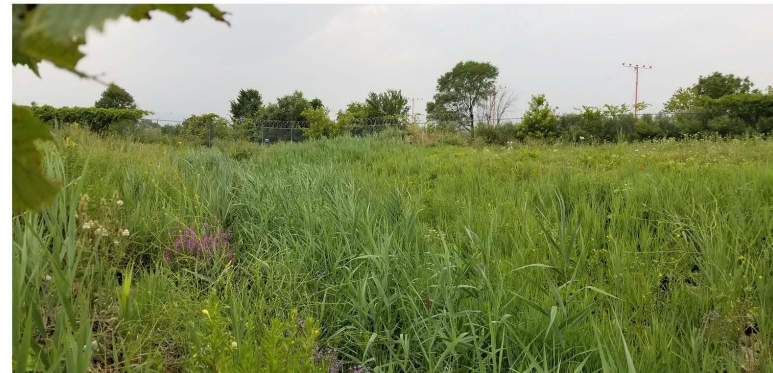
Photo 32. Ditch 03, General site, View to the west