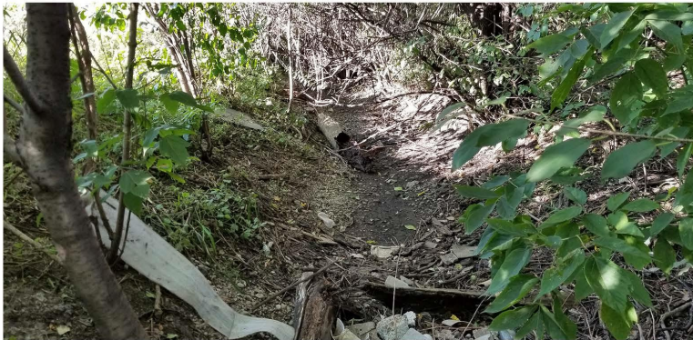
Photo 43. Ditch 08, General site, View to the south