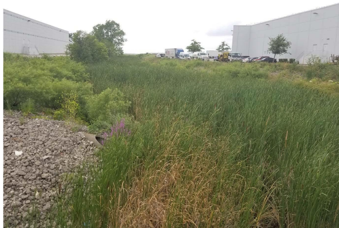
Photo 15. Crystal Creek - Section 2, General site, View to the north