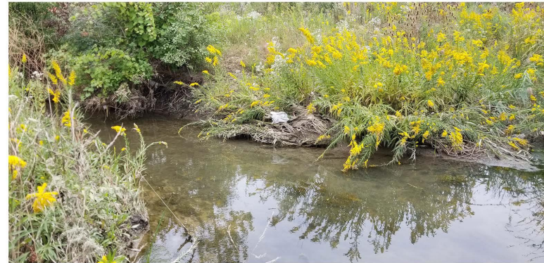
Photo 68. Ditch 18, Wracking. View to the south