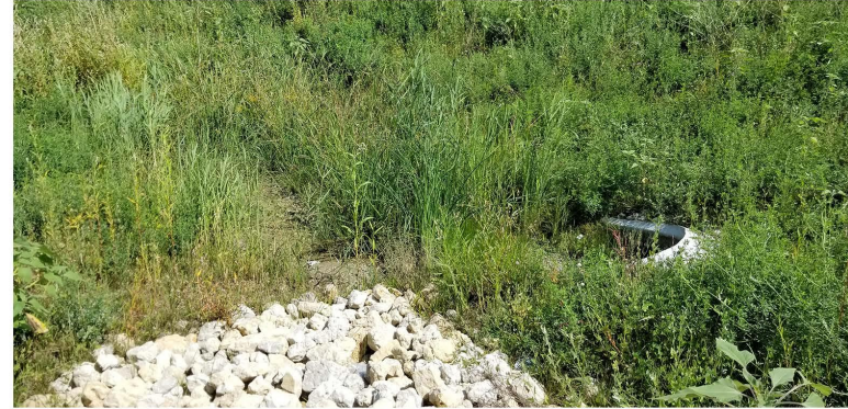
Photo 38. Ditch 06, Culvert