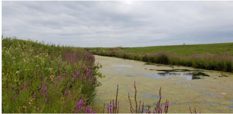
Photo 13. Crystal Creek - Section 1, General site, View to the north