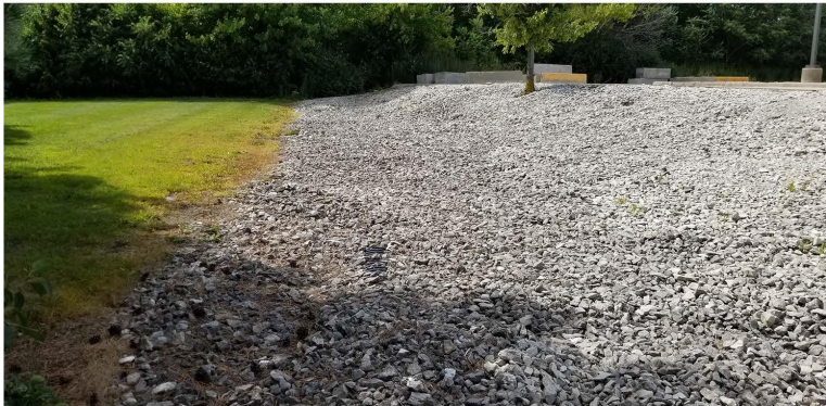
Photo 27. Ditch 01, South culvert, View to the west