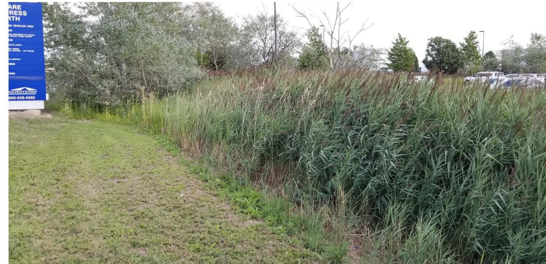
Photo 30. Ditch 02, General site, View to the east