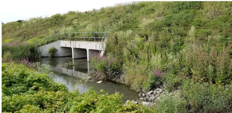
Photo 3. Bensenville Ditch - Section 1, Box culvert. View to the southwest