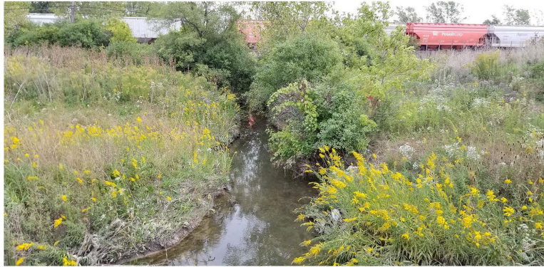
Photo 69. Ditch 18, General site, View to the east