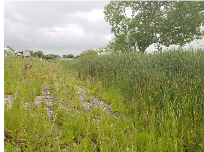
Photo 14. Crystal Creek - Section 2, General site, View to the south