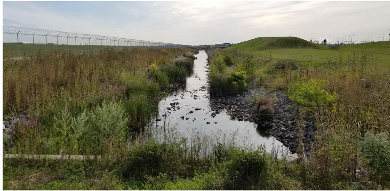
Photo 5. Bensenville Ditch - Section 2, General site, west end. View to the east