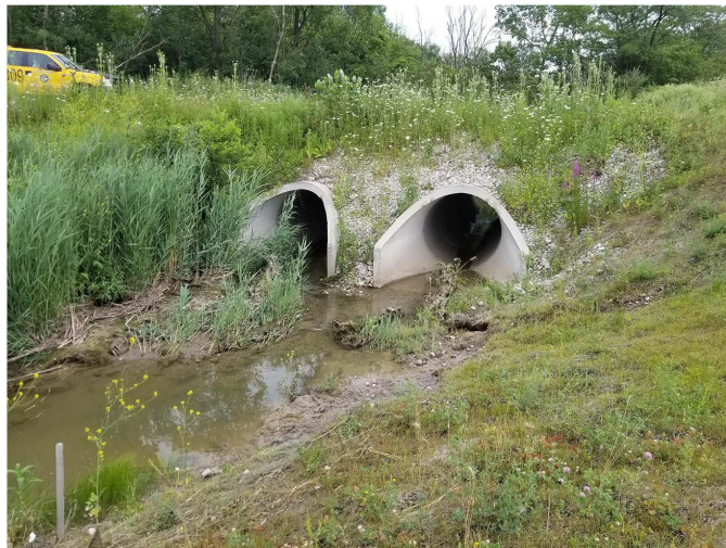
Photo 59. Ditch 13 - Section 2. Twin culvert, View to the north