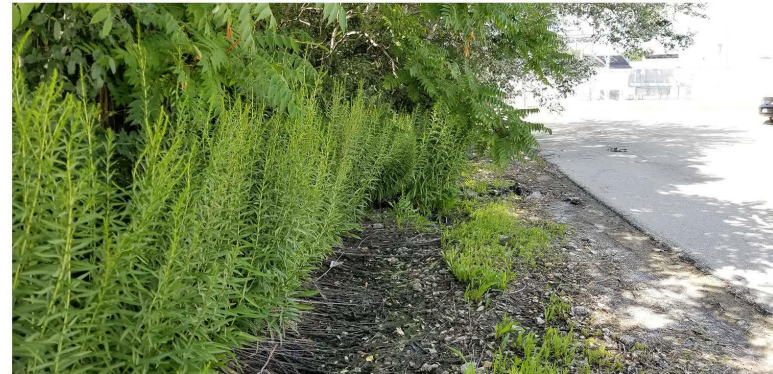
Photo 28. Ditch 01, General site, View to the north