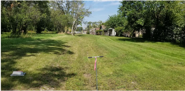
Photo 73. Ditch 20, Landscaped ditch section. View to the north