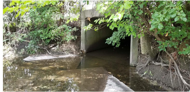
Photo 18. Crystal Creek - Section 3, Box culvert under Manheim Road