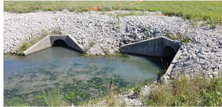
Photo 46. Ditch 09, Culverts in south section