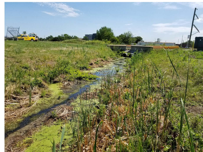
Photo 48. Ditch 10, General site, View to the east