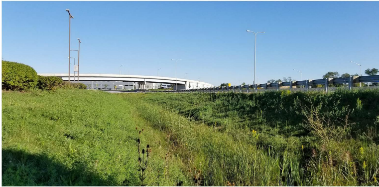
Photo 65. Ditch 15, General site, View to the north