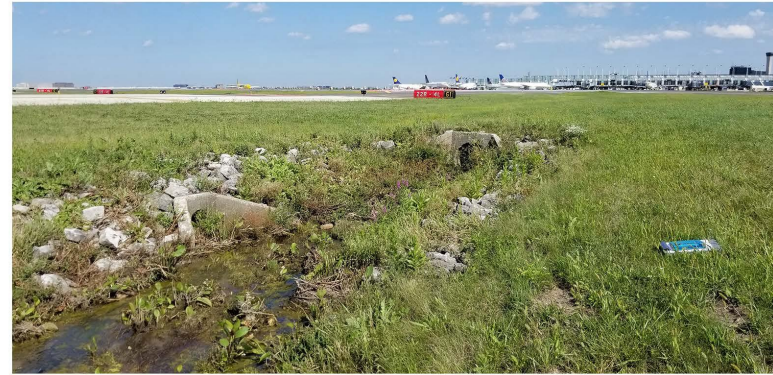
Photo 54. Ditch 12, Culverts in east end. View to the east