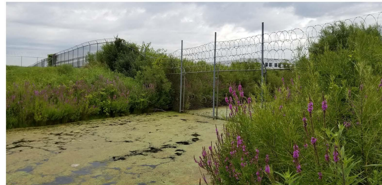
Photo 12. Crystal Creek - Section 1, General site, View to the south