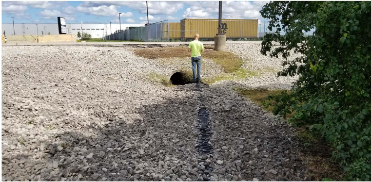
Photo 25. Ditch 01, South culvert, View to the east