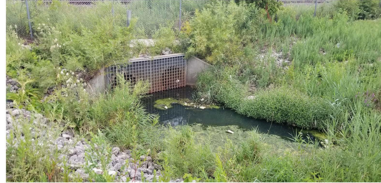
Photo 34. Ditch 03, West culvert