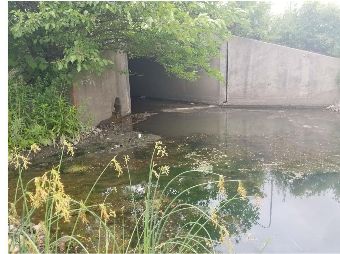
Photo 22. Crystal Creek - Section 4, Culvert View to the north