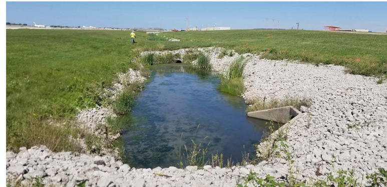
Photo 44. Ditch 09, General site, View to the north