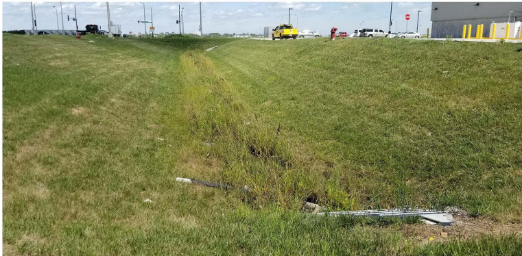
Photo 35. Ditch 04, General site, north section. View to the north