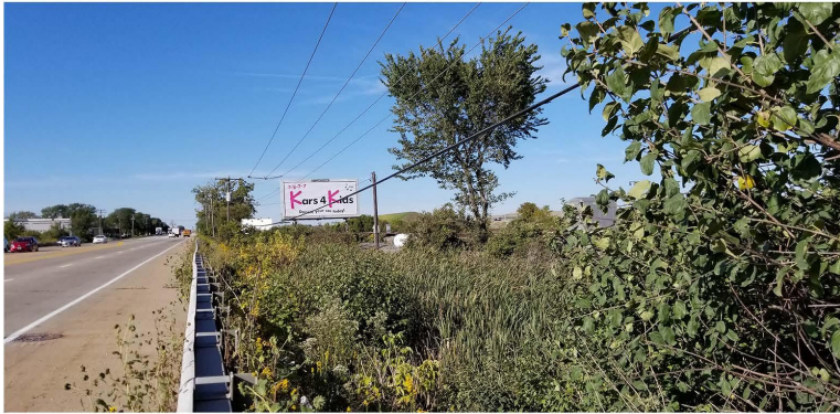
Photo 41. Ditch 08, General site, View to the north