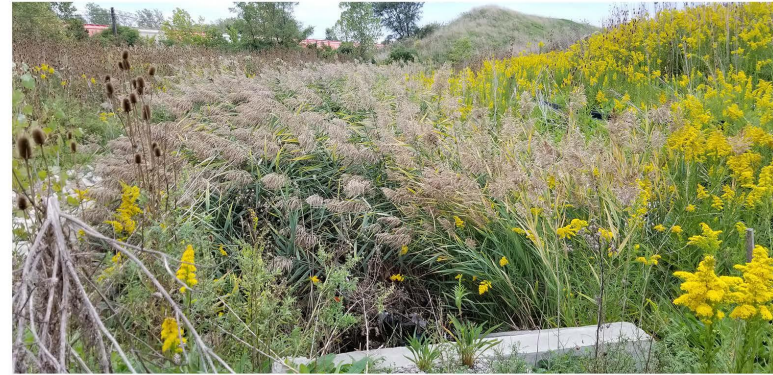
Photo 66. Ditch 16, General site, View to the south