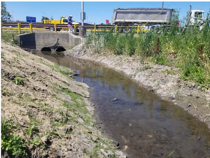
Photo 51. Ditch 11, General site, View to the west