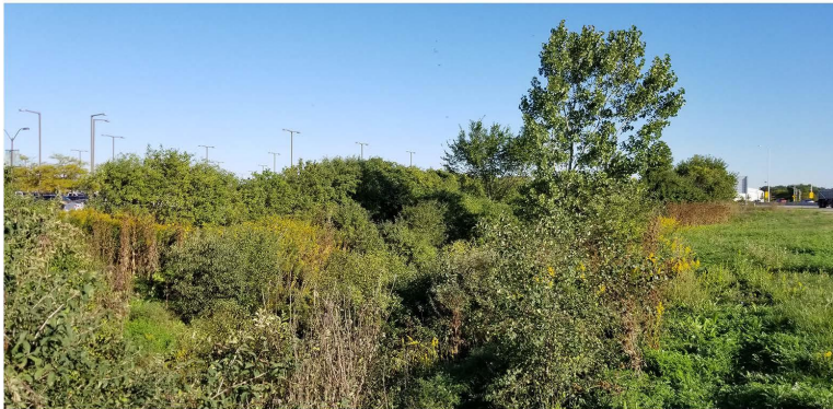
Photo 63. Ditch 14, General site, View to the north