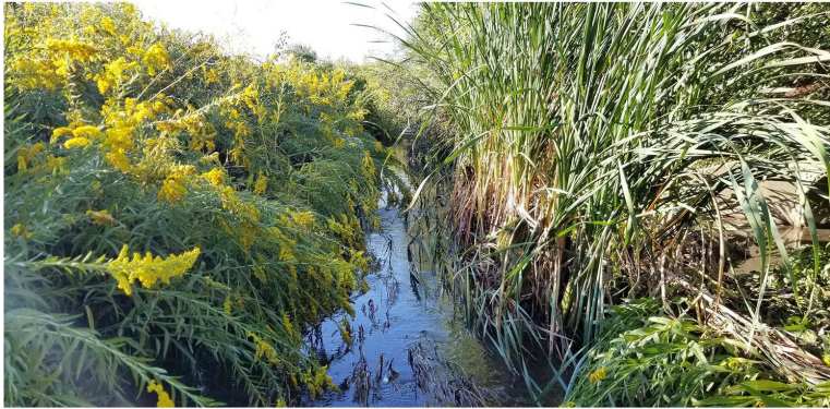
Photo 61. Ditch 14, General site, View to the south