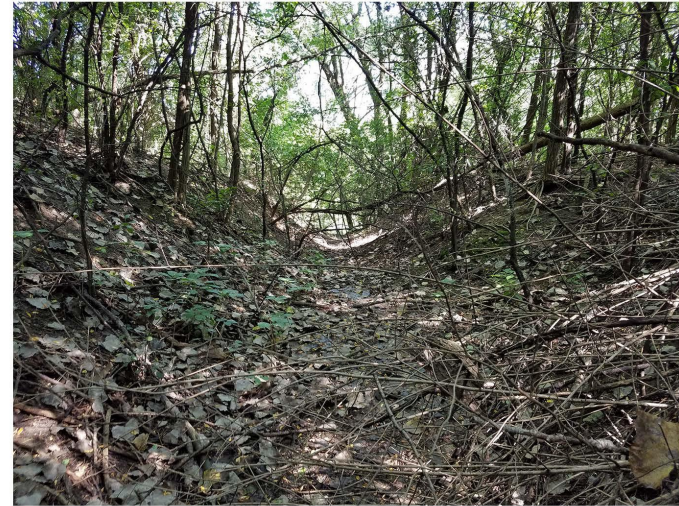
Photo 70. Ditch 19, Downstream, View to the north