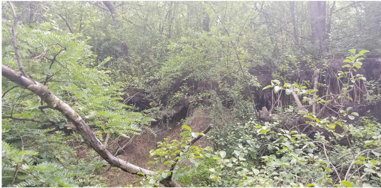
Photo 57. Ditch 13 - Section 2, Left bank slumping. View to the north