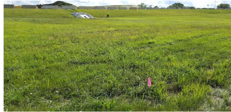
Photo 246. NW19-077, General site, View to the southwest