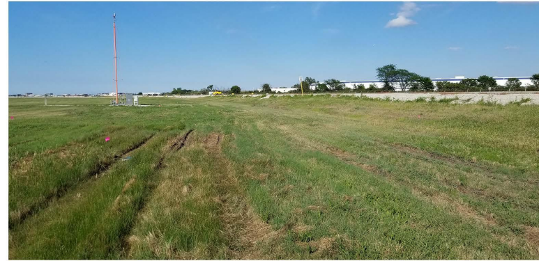
Photo 294. SE19-048, General site, View to the east