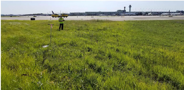
Photo 255. NW19-083, General site, View to the north