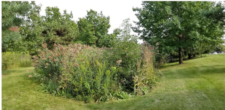
Photo 275. SE19-024, General site, View to the south