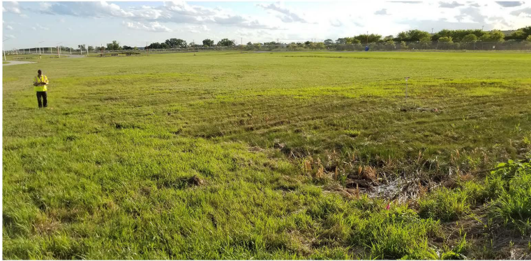
Photo 249. NW19-078, General site, View to the southwest