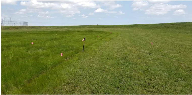
Photo 285. SE19-046, Data points, View to the east