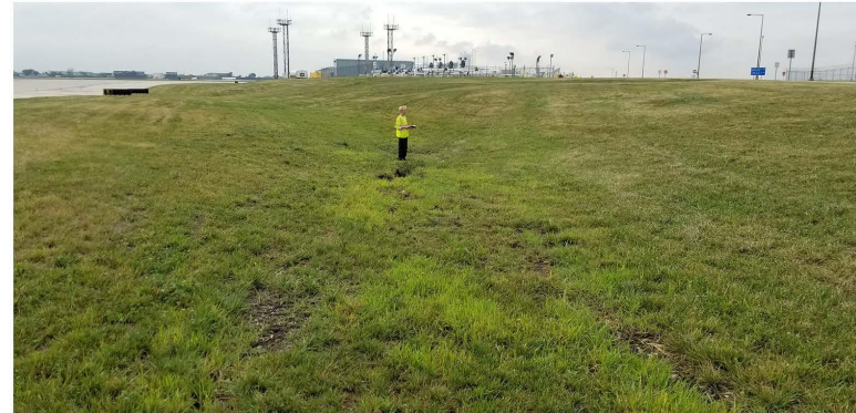
Photo 278. SE19-025, General site, View to the south