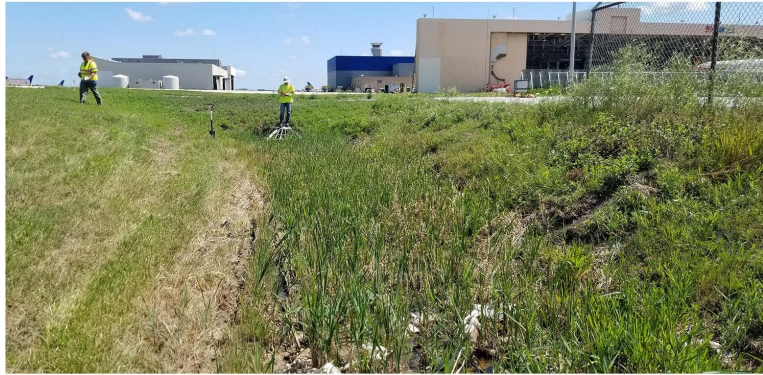
Photo 225. NW19-007, General site, View to the north