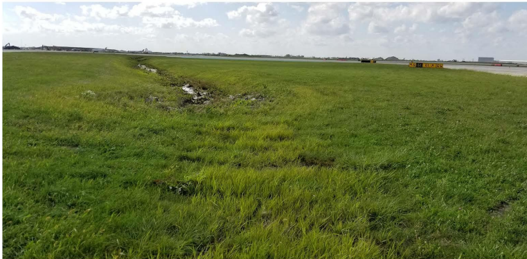
Photo 259. NW19-091, General site, ditch connection. View to the west