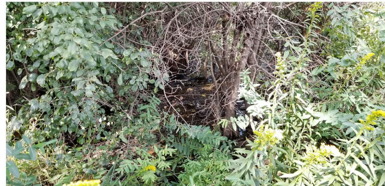
Photo 268. NW39, General site, standing water. View to the west