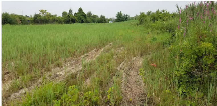
Photo 235. NW19-012, General site, mower ruts. View to the north