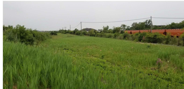
Photo 236. NW19-012, General site, View to the south