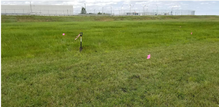
Photo 289. SE19-046, Data points, View to the north