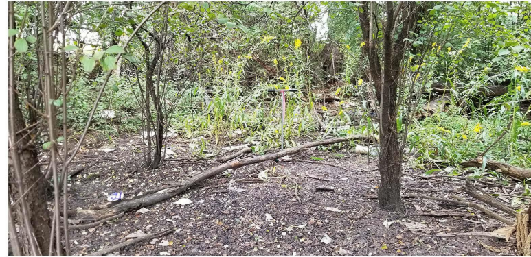
Photo 274. SE01 SE19-125, General site, View to the south