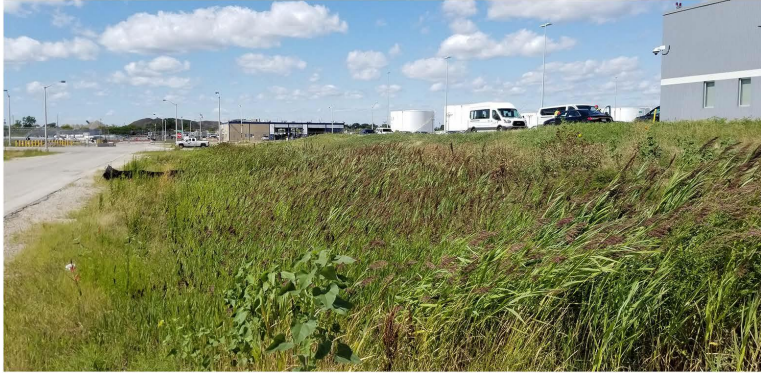
Photo 257. NW19-084, General site, View to the northwest