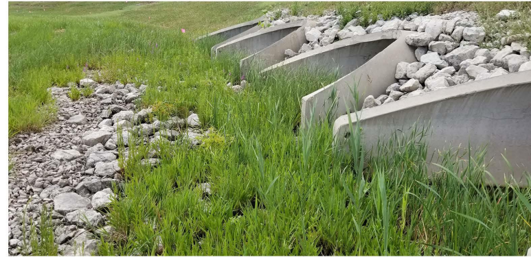
Photo 286. SE19-046, General site, culverts