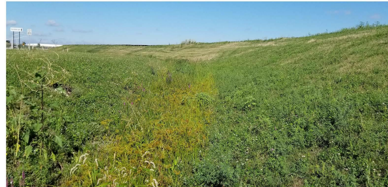
Photo 240. NW19-075, General site, View to the west