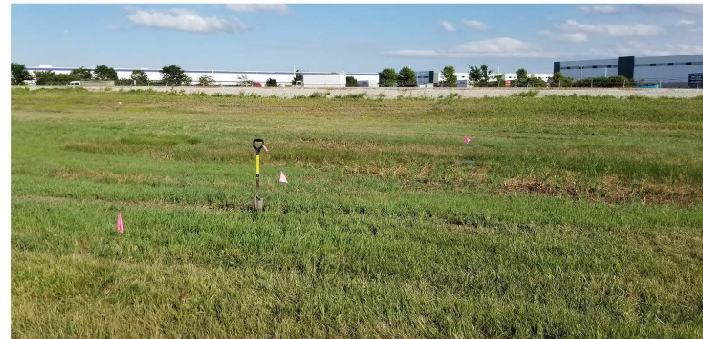
Photo 292. SE19-048, Data points, View to the south