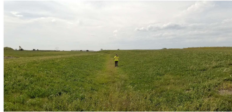
Photo 266. NW19-103, General site, View to the west