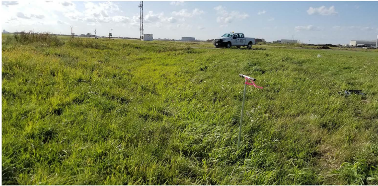
Photo 261. NW19-092, General site, View to the west