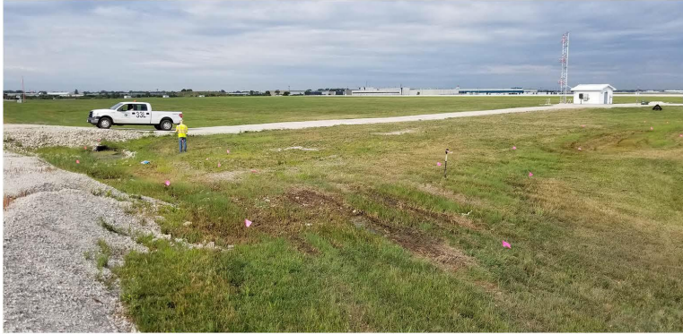
Photo 297. SE19-050, General site, View to the northwest