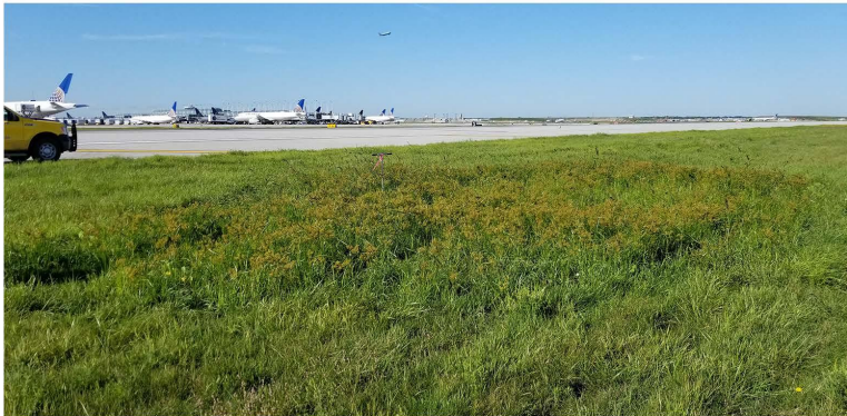
Photo 251. NW19-080, General site, View to the south