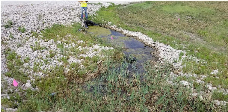
Photo 299. SE19-050, General site, standing water