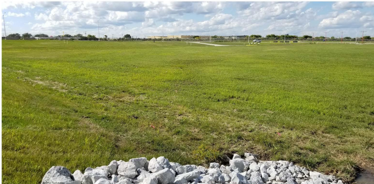
Photo 247. NW19-077, General site, View to the northwest