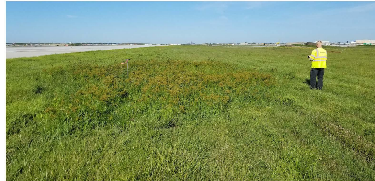
Photo 252. NW19-080, General site, View to the west