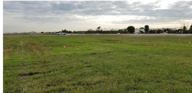
Photo 296. SE19-049, General site, View to the east