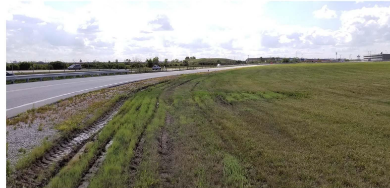
Photo 290. SE19-047, General site, View to the west