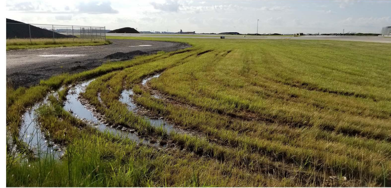
Photo 238. NW19-018, General site, View to the east