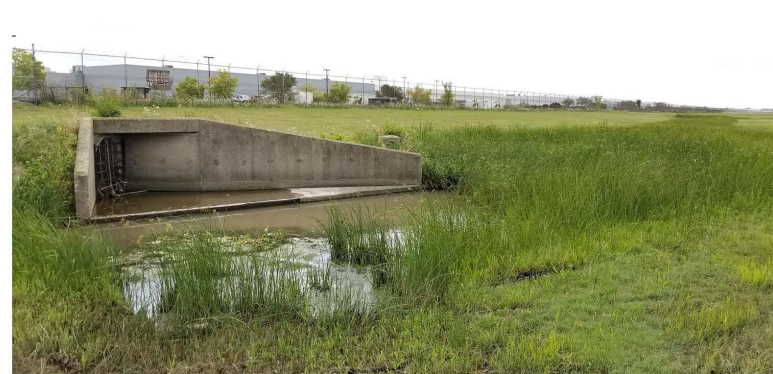
Photo 304. SE19-053, General site, east culverts. View to the south