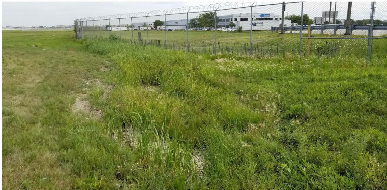
Photo 303. SE19-052, General site, View to the east