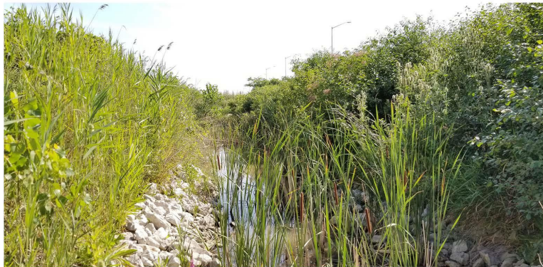
Photo 231. NW19-010, General site, View to the northeast