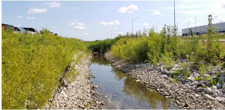
Photo 229. NW19-010, General site, rip rap. View to the northeast