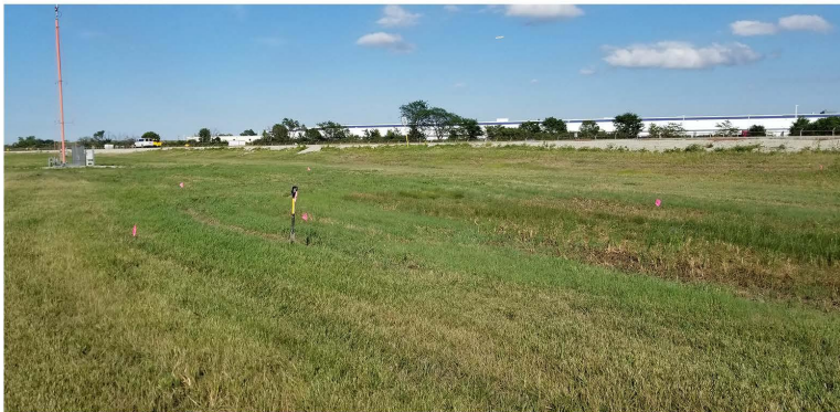
Photo 291. SE19-048, Data points, View to the east