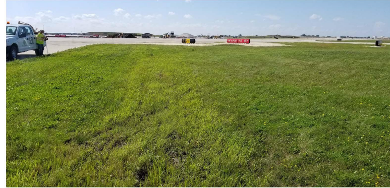
Photo 258. NW19-090, General site, View to the west