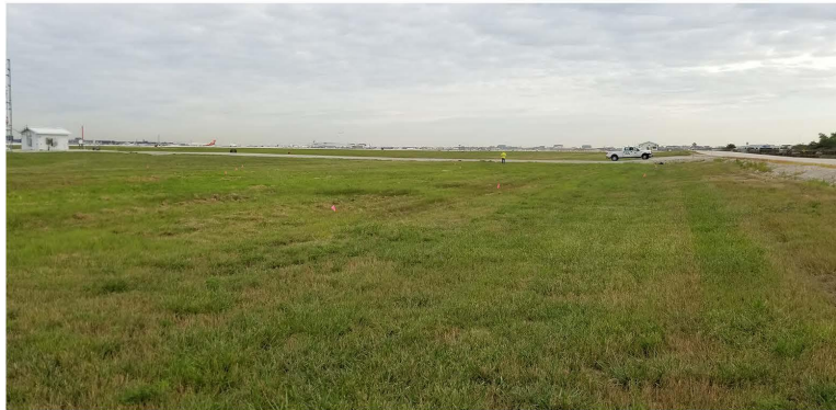
Photo 295. SE19-049, General site, View to the northeast