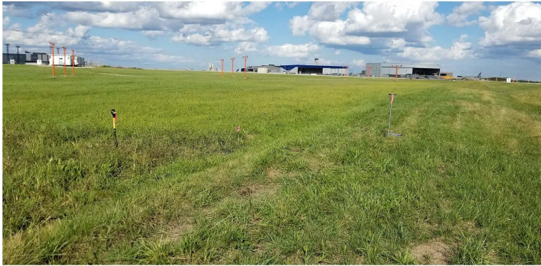
Photo 245. NW19-077, Data points, View to the east