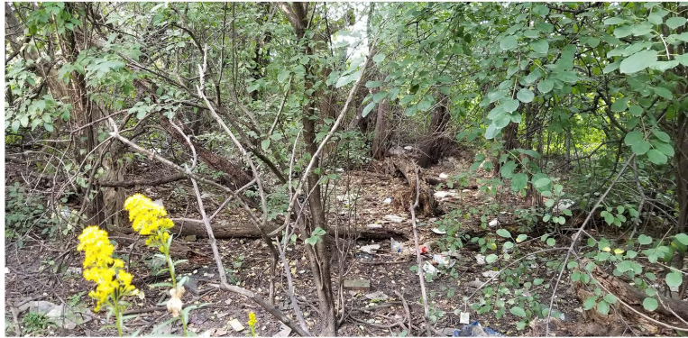
Photo 273. SE01, General site, View to the north