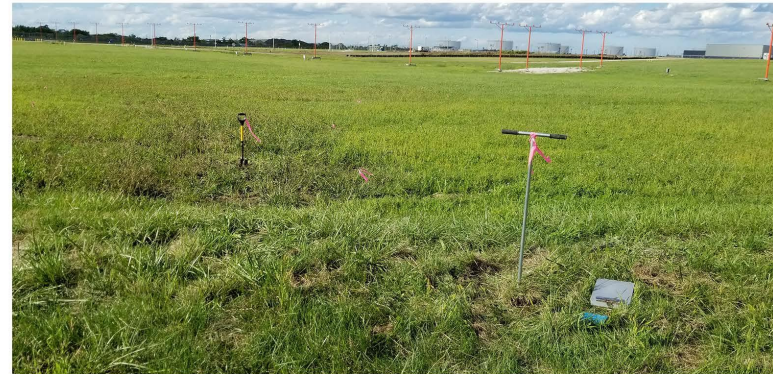
Photo 244. NW19-077, Data points, View to the north