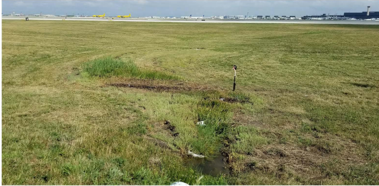
Photo 281. SE19-027, General site, View to the north