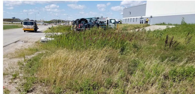
Photo 256. NW19-084, General site, View to the northwest