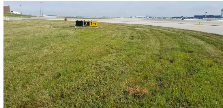
Photo 280. SE19-026, General site, View to the north