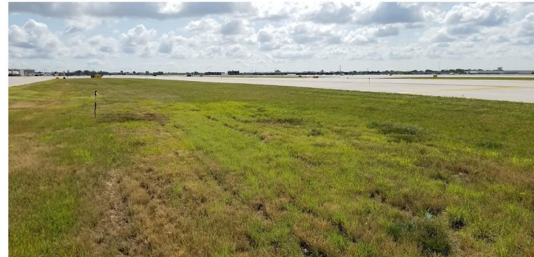
Photo 284. SE19-043, General site, View to the east