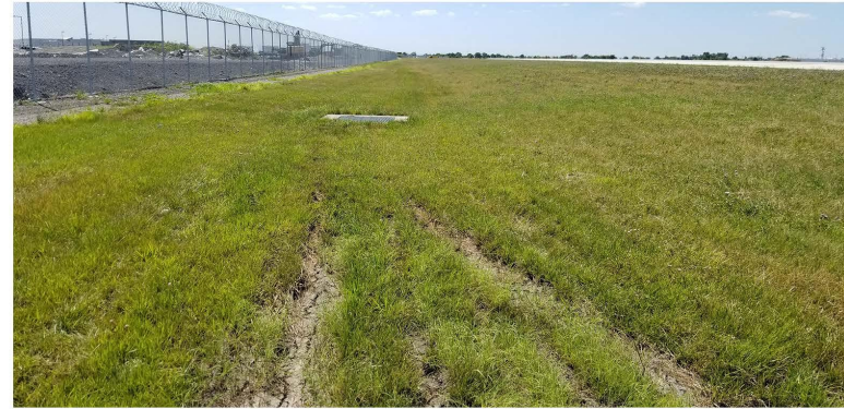
Photo 226. NW19-008, General site, drop inlet. View to the south