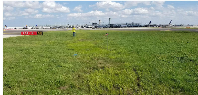
Photo 260. NW19-091, General site, View to the east