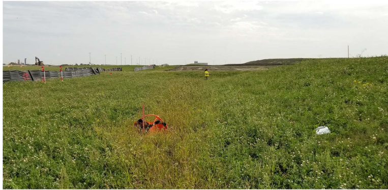
Photo 265. NW19-103, General site, View to the south