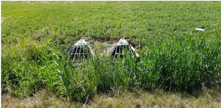
Photo 239. NW19-075, General site, culverts