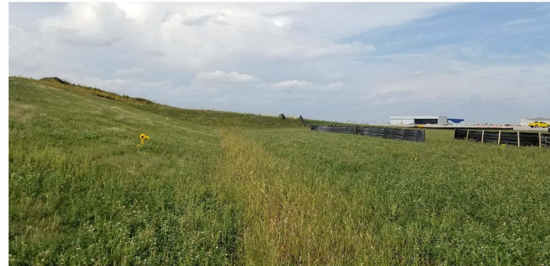
Photo 264. NW19-103, General site, View to the north