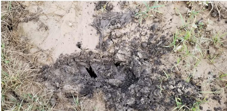
Photo 279. SE19-025, General site, soil. covered inlet