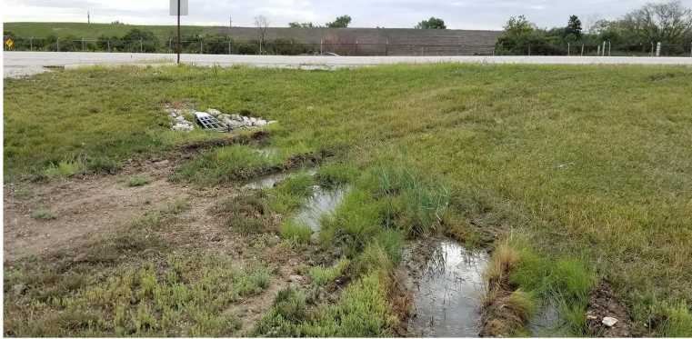
Photo 301. SE19-051, General site, culvert. View to the south