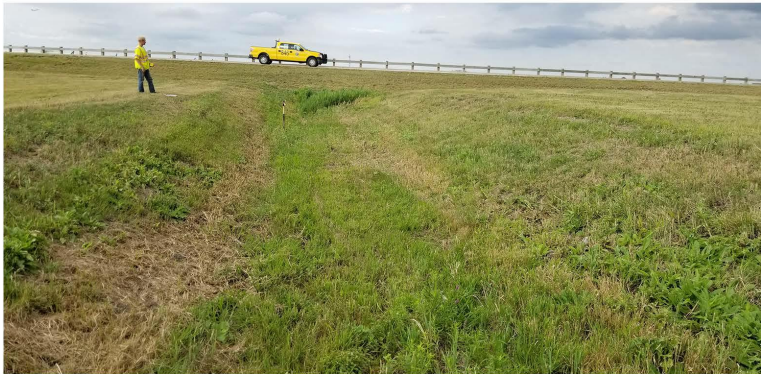
Photo 283. SE19-041, General site, View to the east