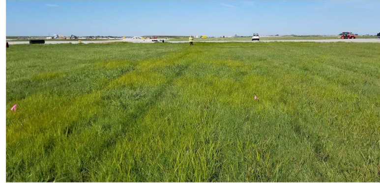
Photo 254. NW19-082, General site, View to the west