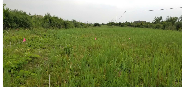
Photo 234. NW19-012, Data points, View to the south