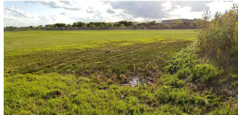
Photo 248. NW19-078, General site, View to the west