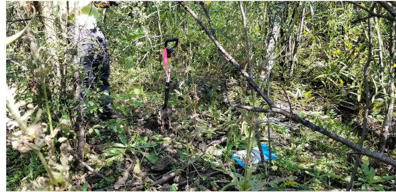
Photo 270. NW39, Data point, upland