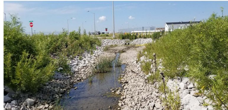
Photo 228. NW19-010, General site, gravel bottom. View to the southwest