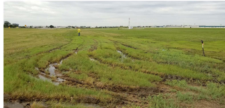
Photo 300. SE19-051, General site, View to the west