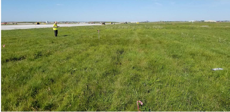
Photo 253. NW19-081, General site, View to the west