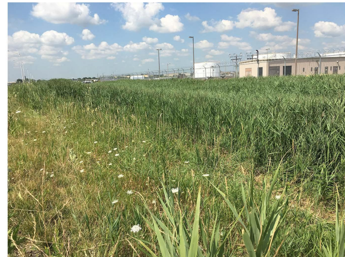
Photo 232. NW19-011, General site, View to the southwest