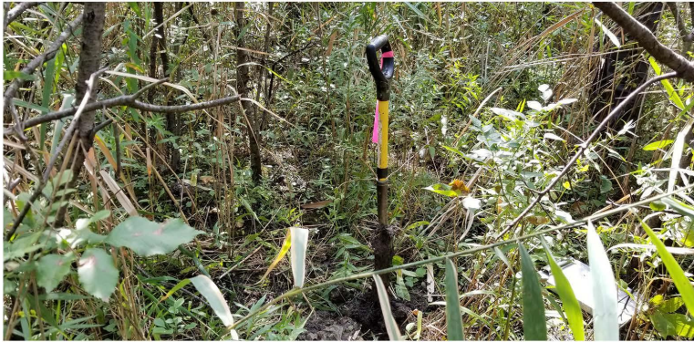
Photo 269. NW39, Data point, wetland