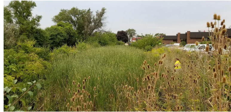
Photo 262. NW19-096, General site, View to the north