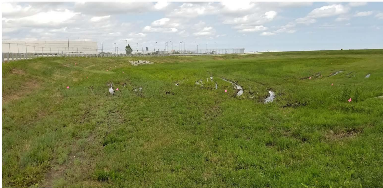
Photo 287. SE19-046, General site, View to the north