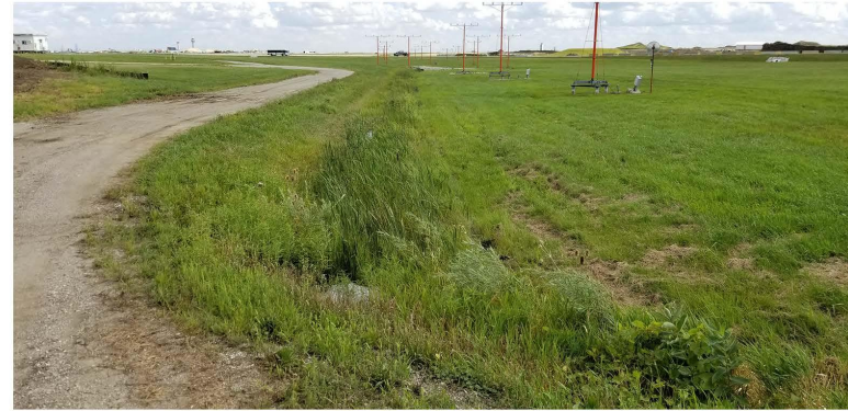
Photo 242. NW19-076, General site, View to the east