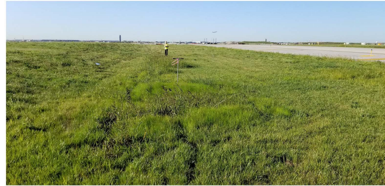
Photo 250. NW19-079, General site, View to the south