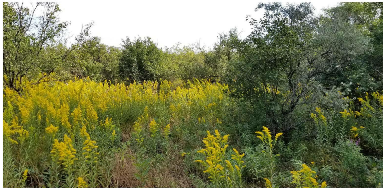
Photo 267. NW39, General site, View to the west