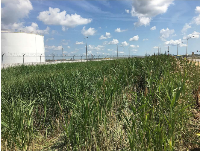
Photo 233. NW19-011, General site, View to the northeast