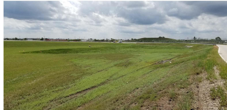
Photo 288. SE19-046, General site, View to the west