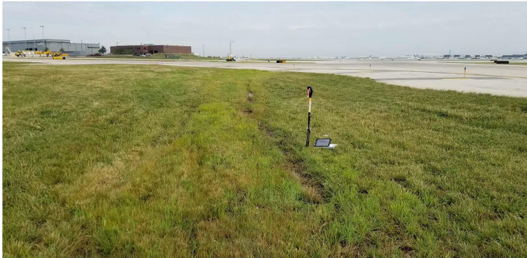
Photo 277. SE19-025, General site, View to the north