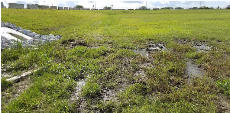
Photo 243. NW19-077, General site, rutting and standing water. View to the west