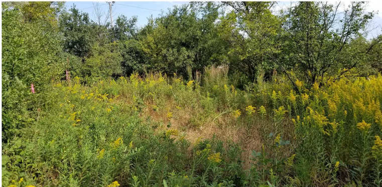
Photo 271. NW39, General site, View to the north