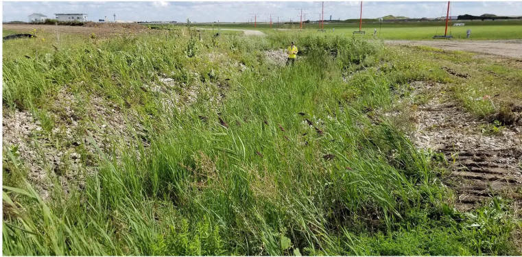
Photo 241. NW19-076, General site, rip rap section. View to the east