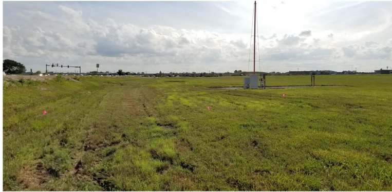
Photo 293. SE19-048, General site, View to the west