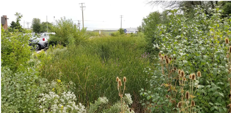
Photo 263. NW19-096, General site, View to the south