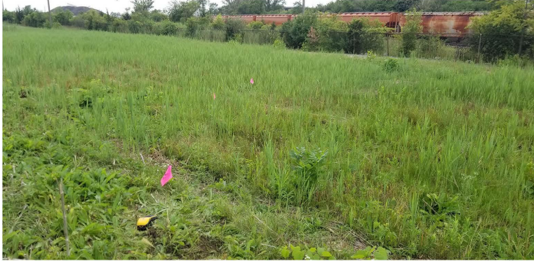
Photo 237. NW19-012, Data points, View to the southwest