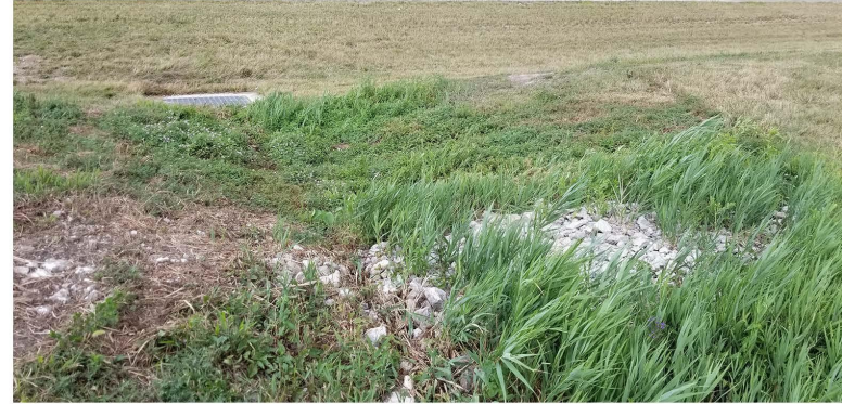
Photo 282. SE19-041, General site, drop inlet and rip rap