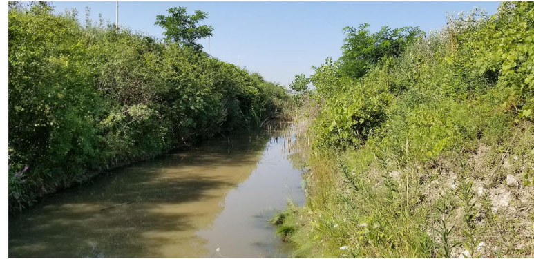
Photo 230. NW19-010, General site, View to the southwest