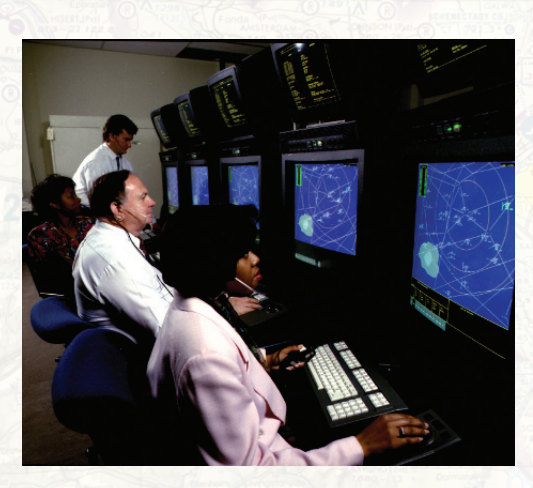
Modernization of ARTCCs help controllers meet growing demand for service

The advanced automation program FAA began in the early 1980s, was a key program in the new transportation policy. Under this ambitious development and acquisition program, FAA set out