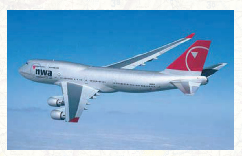
Open Skies agreements facilitate global partnerships

On March 31, 1992, DOT announced the United States would explore aviation agreements with all European countries willing to allow free access to their markets. In the past, the United States had offered such agreements to only a few of its largest aviation partners.