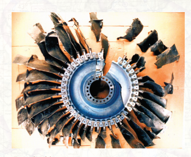
Example of damage to rotating engine parts

A July 1989 crash highlighted the need for careful inspection of rotating engine parts. After debris from a failed engine damaged its control system, a United Airlines DC-10 crashed while attempting an emergency landing in Sioux