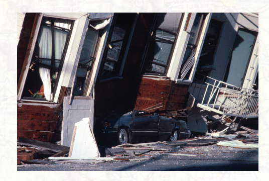
1989, Loma Prieto, California, earthquake destroys an apartment building, which collapses on an automobile

Exactly one month after Hurricane Hugo hit the Virgin Islands, an earthquake registering 7.1 on the Richter scale shook northern California, damaging runways, disrupting airline service, and causing approximately $50 million damage to FAA facilities and