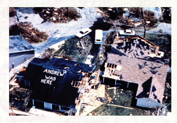
Hurricane Andrew damage

The hurricane destroyed or badly harmed the homes of about 144 FAA employees in the Miami area, and the