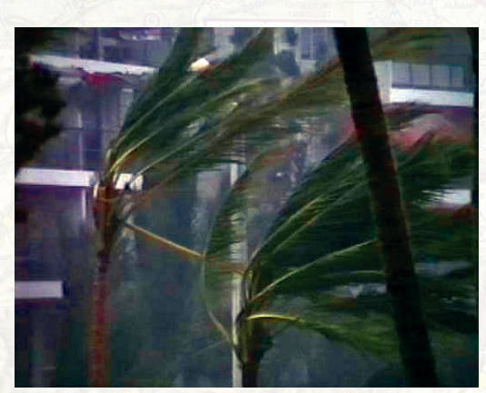
Hurricane Hugo winds

While FAA officials worked together with their colleagues at DOT to increase international safety and security, a number of natural