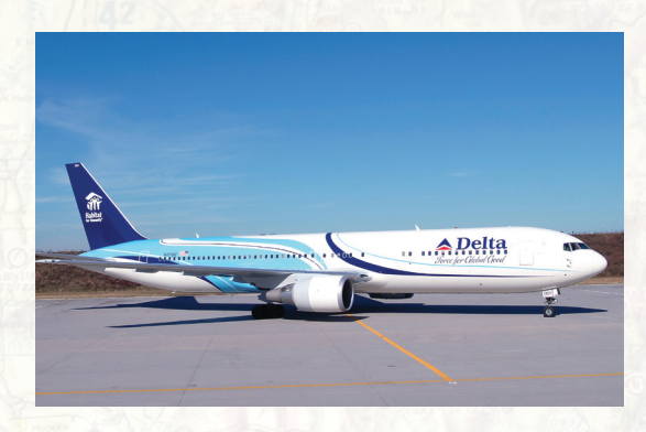
Many airlines form global partnerships

January 11, 1993, DOT gave Northwest and KLM immunity from antitrust laws so they could operate as one airline. The trend toward greater collaboration with foreign carriers was further illustrated