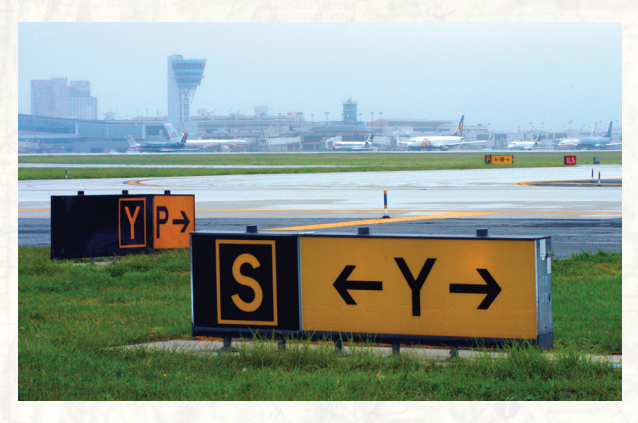
Runway incursion prevention includes airport signs

addition, FAA announced a runway incursion plan that would test advances in runway marking, lighting, and signs at the Boston, SeattleTacoma, and Pittsburgh airports, and the new Denver airport (then