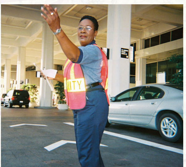
Tightened airport security results from the Pan Am 103 bombing

by cooperative plans announced in 1993 by the following U.S. airlines: Delta (with Swissair); Continental (with Air France); United (with Lufthansa); and USAir (which announced a scaled-back version of a plan