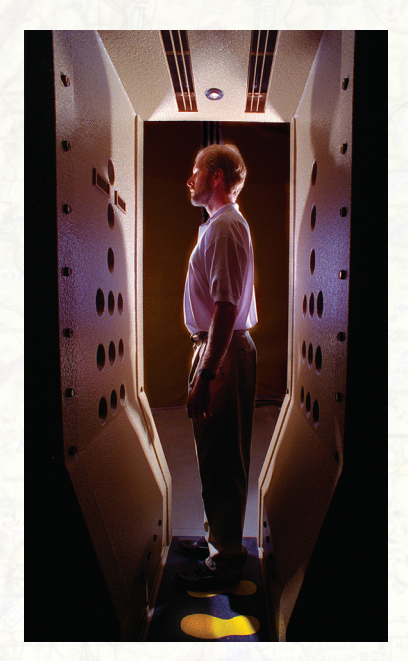
Government and industry partners develop new security screening equipment

In June 1991 FAA issued a security regulation for foreign air carriers operating into or out of airports in the United States. The new rule required such carriers to provide a level of protection similar to that of U.S. carriers serving the same airports. Two months later — as mandated by the Aviation Security Improvement Act — FAA issued a rule prescribing more stringent standards for hiring, training, and performance of airline and airport security personnel. Then, in October, FAA inaugurated the Federal