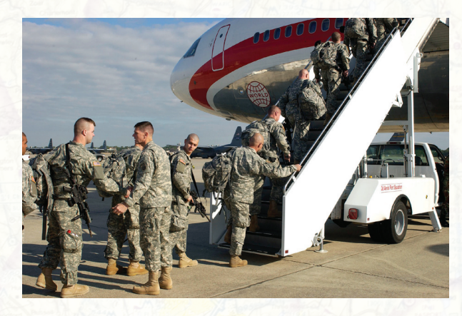
Civil Reserve Air Fleet aircraft transports soldiers

To speed the movement of increasingly large numbers of U.S. troops to the Middle East, for the first time in history, the Department of Defense (DoD) activated the Civil Reserve Air Fleet (CRAF) on August 17, 1990. Comprised