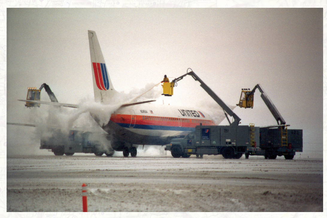
New aircraft deicing rules improve safety

The conference reflected global concern about icing and produced a series of recommendations for combating this hazard. On September 25 FAA announced a requirement for airlines using large aircraft (Part 121) to have an approved ground de-icing/anti-icing program in place by November 1, 1992. On December 29, 1993, FAA announced stronger deicing requirements for commuter and air taxi pilots to check aircraft surfaces before taking off in adverse weather. The agency also mandated certain new training and checking requirements for pilots for commuter aircraft and larger private planes.