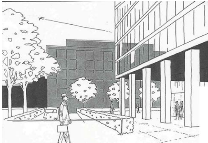
The view from the north side of the building

The building's access to major transportation routes was also important to commuters. "Public and private highway transportation is fast being improved by new bridges across the Potomac and modern expressways leading into the District from all areas west of the River." Furthermore, the "building is less than 10 minutes from Union Station, 15 minutes from Washington National Airport, 40 minutes from Dulles International Airport."