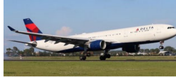
A330-300 - 31