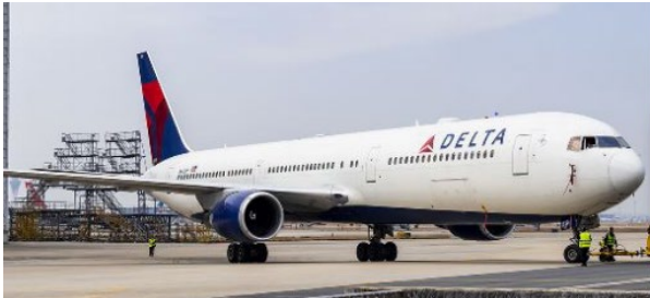
B767-400ER - 21