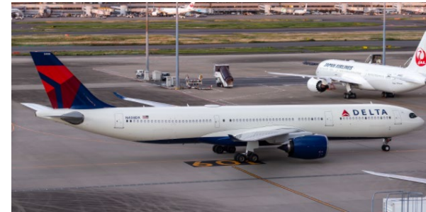
A330-900 - 11