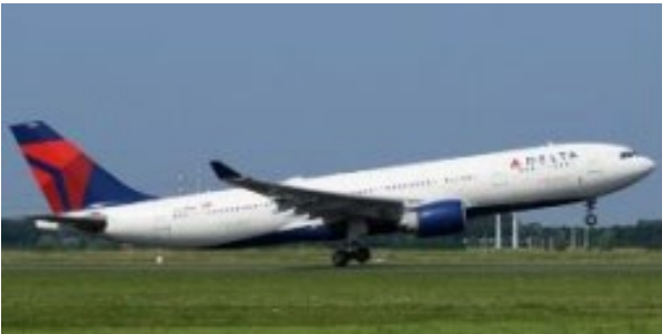
A330-200 - 11