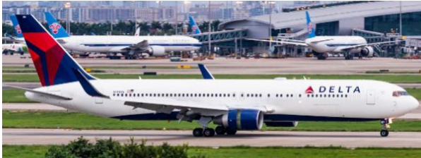
B767-300ER – 39