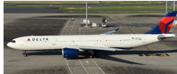
A350-900 - 15