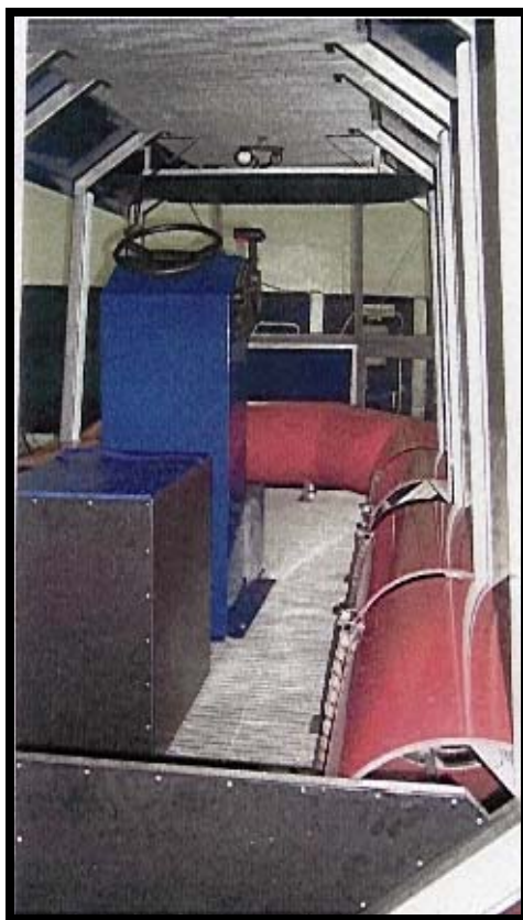
Figure 2: View looking forward from the transom showing the coxswain's seat and console.

All the rolls are described as referenced from the stern of the FRC looking forwards so that the coxswain and crew are at 0°. If the FRC rolled clockwise, (i.e. to the right) the starboard lookout would enter the water at 90° and finish rolling at 180°, whereas the port lookout would start the roll in air at 270°, enter the water at 90° and finish at 180°.