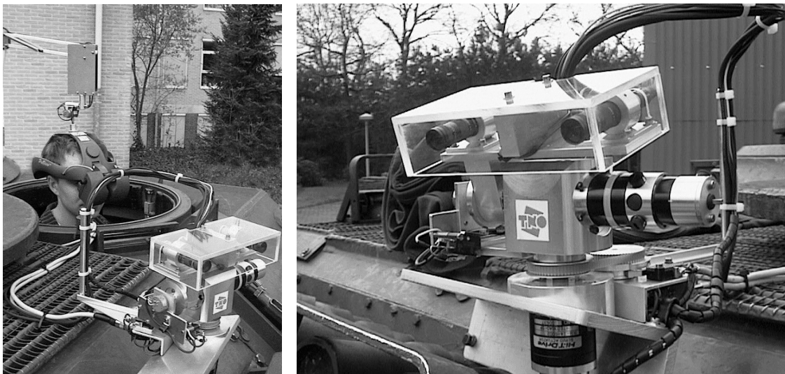
Figure 1. The TNO Human Factors head-slaved camera system mounted on an armoured vehicle. On the left, the camera motion platform with the two cameras, the HMD and the mechanical headtracker is shown, while a close-up of the camera platform is shown on the right. The periscopes are located just in front of the hatch opening.

In general, motion sickness occurs when the brain receives inadequate or conflicting sensory information about the orientation and movement of the body in its environment (Reason & Brand, 1975). Especially information about the orientation of the head relative to the gravitational force is critical (Bles, Bos, De Graaf, Groen & Wertheim, 1998). The different sensory systems provide a coherent set of information about the orientation in the world in normal circumstances. However, discrepancies between the visual information and the vestibular and proprioceptive information about real world motions may occur when an indirect viewing system is used. Such discrepancies are known to provoke motion sickness.