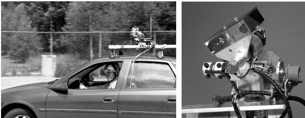
Figure 2. The modified head-slaved camera system (3 rotational DOFs) mounted on a passenger car (left side), and a close-up of the system (right side).

Two CCD cameras were mounted parallel on the platform with an inter-camera distance of 8 cm. This was smaller than the distance of 12 cm used by Oving and Van Erp (2001a, 2001b), although this horizontal separation is still considerably larger than the average inter-pupillary distance (i.e., 6.4 cm). The NTSC camera images were converted to VGA before they were displayed in the HMD. The HMD was a Kaiser ProView60, with a FOV of 48^\circ (H) \times 36^\circ (V) and a resolution of 640 (H) \times 480 (V) pixels. In combination with the lens type that was used, this resulted in a magnification factor of approximately 0.96 (i.e., objects in the camera images thus appeared to be slightly smaller than they were in reality). The update rate of the image system was 60 Hz. The delay in the image channel was approximately 50 ms, on average. This is exclusive of any dynamic latency due to the response characteristics of the motion platform. The mechanical headtracker allowed for 6 DOFs of head motion, but only registered the three rotations. The motion box of the mechanical headtracker did not limit normal head motions during driving.