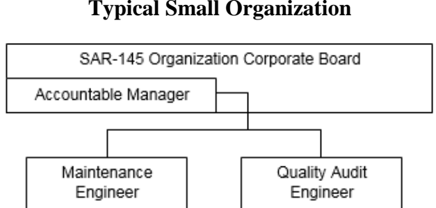
Figure B-2. Typical Small Organization

Quality Audit personnel must remain independent of the Maintenance Manager. Release to Service (RTS) personnel may report instead to the Quality Manager position.