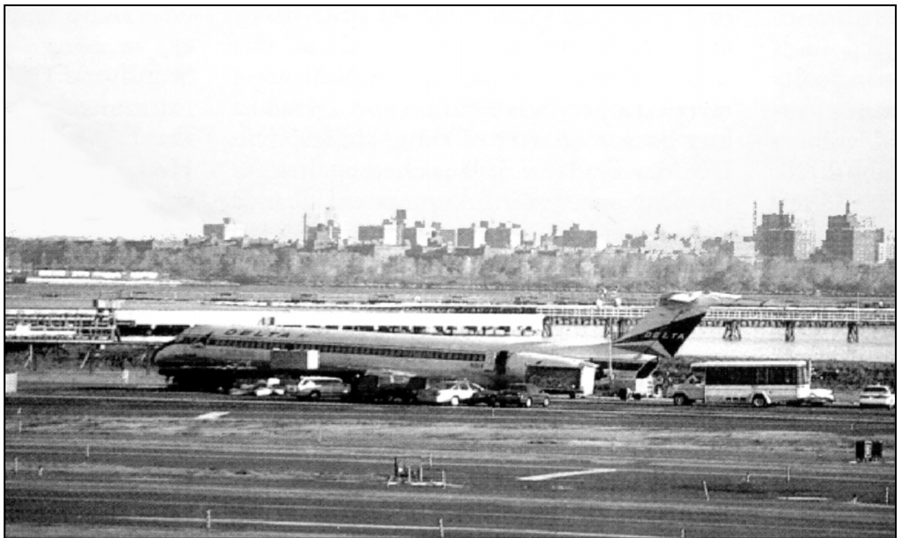
FIGURE 2. This photo shows the wreckage of Delta 554 as it sat aside Runway 13 at LaGuardia Airport. Three passengers suffered minor injuries during the emergency evacuation that was ordered by the pilot after a report of the smell of jet fuel.

According to the NTSB report, several factors may have contributed to the Delta 554 accident. The lights on Runway 13 were spaced 150 feet apart, while the lights on most runways are 200 feet apart. To pilots accustomed to 200-foot spacing, this difference could result in an overestimation of their altitude by 70 feet. Runway 13 had an infrequently used ILS approach that was made more difficult by the ILS localizer being offset to the right of the runway centerline by several degrees of arc. The ILS approach required the pilot to turn left slightly after transitioning to visual references. In an approach over water under reduced lighting conditions, there