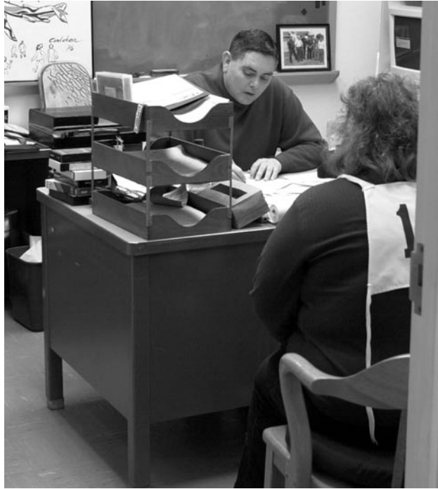
Figure 4. Subject is interviewed by physician concerning potentially disqualifying health condition.

barrier, appeared to be under the influence of alcohol or drugs, or exhibited a potentially disqualifying condition not reflected on the health questionnaire, were directed to a medical interview room (Figure 4). Subjects who arrived without a health questionnaire on file had to complete the health questionnaire, as well as the medical screening, if necessary, before they could participate.