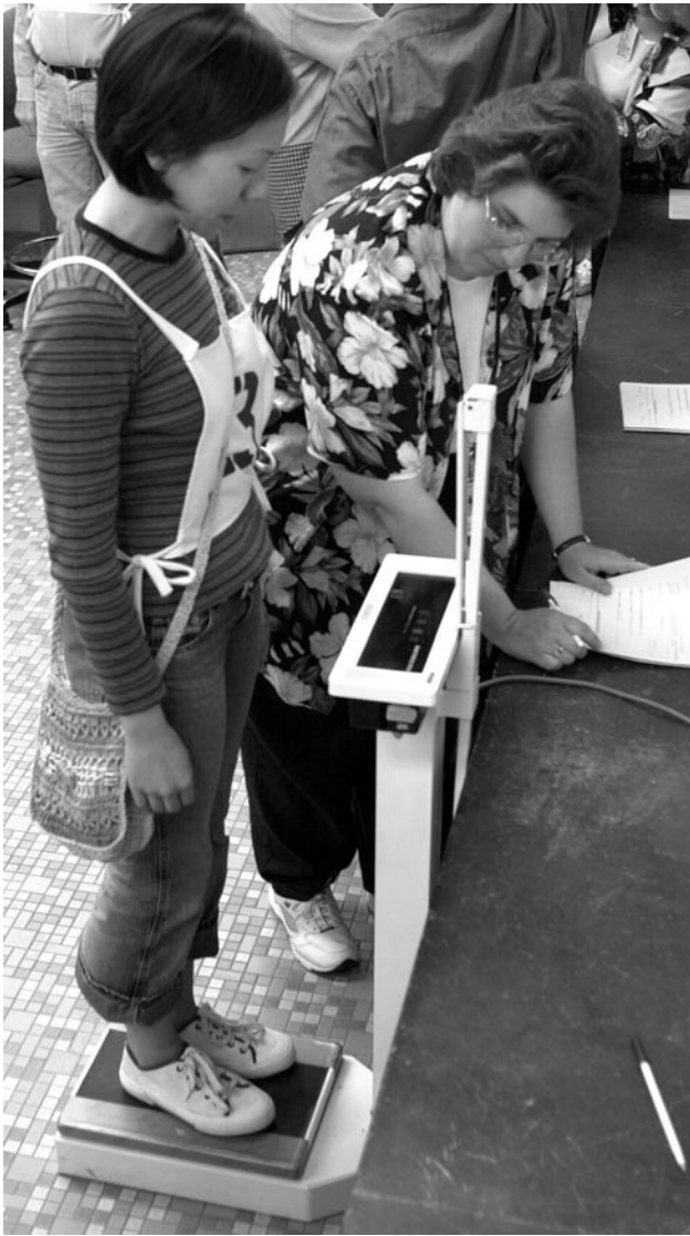
Figure 6. Female subject's weight is documented.