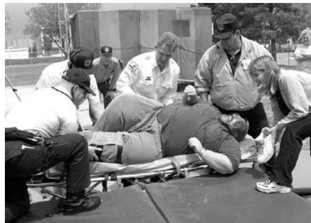
Figure 17. Paramedics secure injured subject on stretcher in preparation for evacuation to hospital.