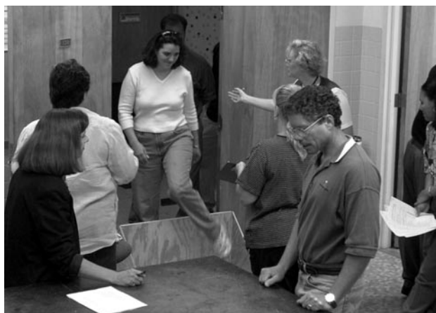
Figure 1. A step-over task assessed gross motor agility as subjects entered lab on test day.

Subject In-processing. As subjects entered the laboratory on test day, their gross motor agility was assessed by a step-over task (Figure 1), utilizing a 16" high barrier similar to the exit sill of a Type-III exit. Subjects' names were then checked against the registration roster (Figure 2), and those who had already been approved were issued a numbered vest (Figure 3). Subjects who required additional medical screening, had difficulty clearing the