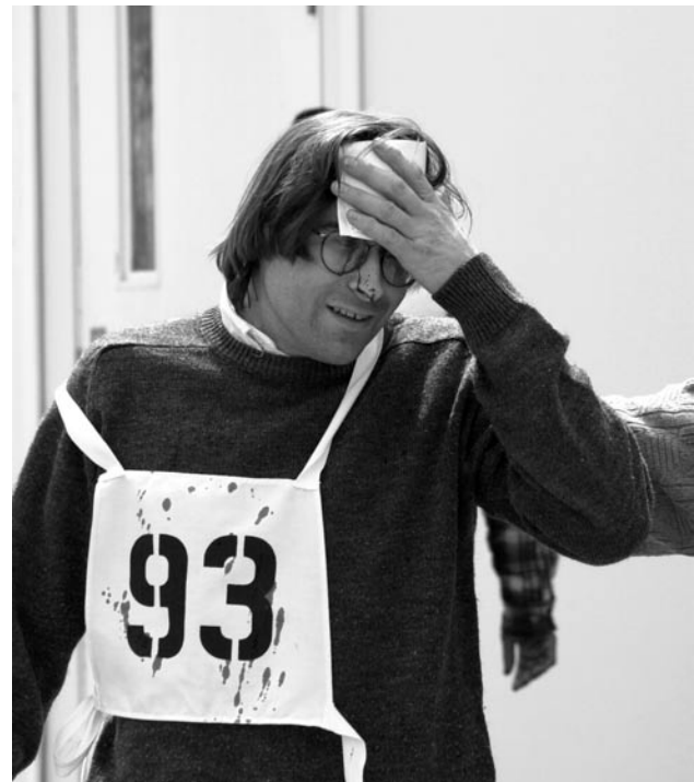
Figure 20. Hatch operator lacerated his head with the top edge of the hatch.

Three hatch operators, two of whom required stitches, hit themselves on the head with the hatch when they pulled it from the exit opening. They reported that they had expected the hatch to be heavier than it was, thereby inducing them to be more forceful than was necessary to remove it, striking themselves on the forehead with the top edge of the hatch (Figure 20).