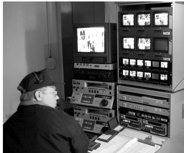
Figure 15. Control station for audiovisual recording of the evacuation trials.