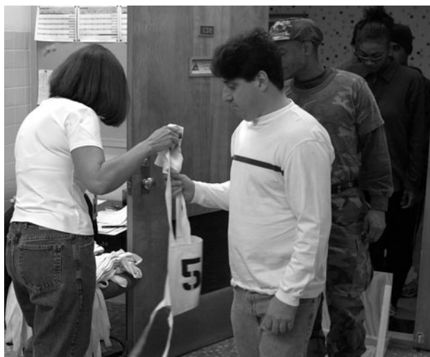
Figure 3. Qualified subjects were issued numbered vests.