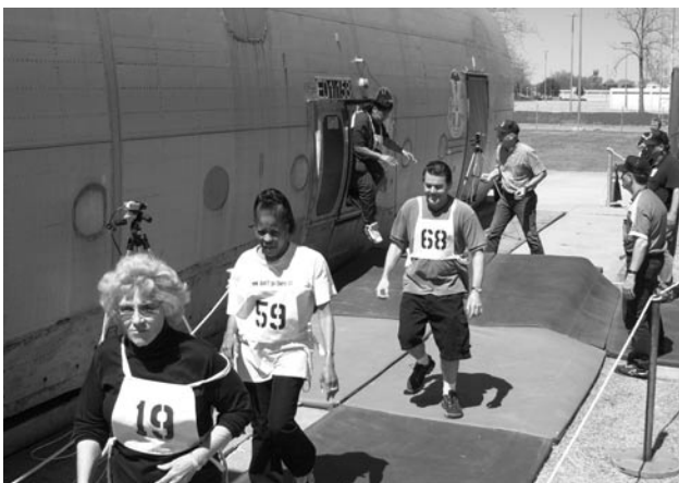
Figure 14. Subjects evacuate through the Type-III exit onto padded "winglet."