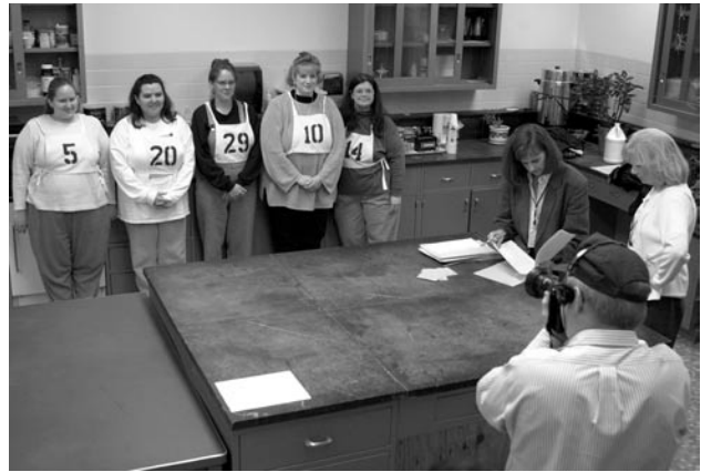
Figure 9. Photographs were taken of all subjects to link vest numbers with appearance.