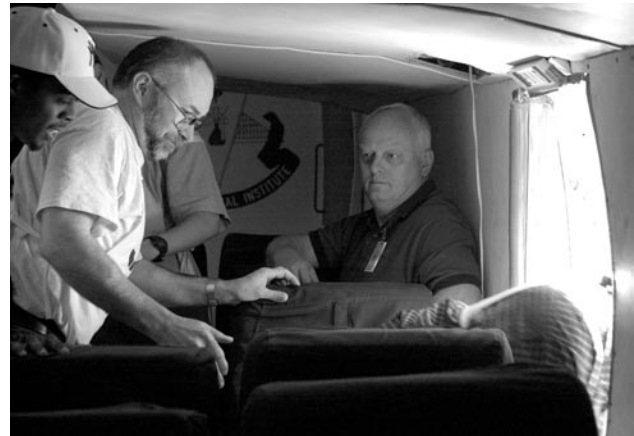
Figure 16. Safety monitor positioned to oversee the evacuation and sound the stop bell if necessary.