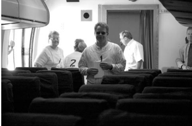
Figure 11. Subjects board the simulator and seat themselves according to the boarding card.

A Familiarization Briefing (Figure 10) was conducted outside the airplane simulator to allow subjects to become acquainted with the equipment layout around the simulator, the evacuation route, and the research team members who could be addressed if a subject had a problem or needed assistance. Another opportunity for subjects to ask questions was provided. Each subject was then issued a boarding card with a specific seat assignment before entering the simulator and being seated (Figure 11).