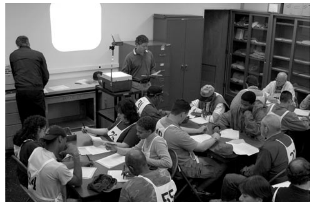
Figure 5. A research team member reads the consent form as subjects follow along.

The Individual's Consent to Voluntarily Participate in a Research Project – Form N (for low-motivation groups; Appendix D) or Form I (for high-motivation groups; Appendix E) was read aloud as the subjects followed along (Figure 5). The form explained the purpose, procedures, and duration of the research, benefits and risks to the subjects and to society, confidentiality of the information collected, voluntary nature of participation, medical care in the event of injury, and whom to contact for answers to pertinent questions about the research. (See 49 CFR 11.116 and 45 CFR 46.116 for the general requirements for informed consent.) Subjects were again given ample opportunity to ask questions before signing the consent form.