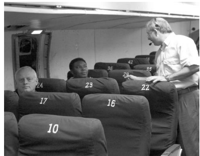
Figure 12. Hatch operator is individually seated in simulator (safety monitor in row ahead).

Experimental Procedure. A start buzzer was used to signal the beginning of each evacuation. At the sounding of the buzzer, the hatch operator removed the hatch and disposed of it (Figure 13). The flight attendants loudly and enthusiastically commanded the subjects to unbuckle their seatbelts and proceed through the Type-III exit, continuing their shouts and gestures throughout the evacuation (Figure 14). After each trial was completed,