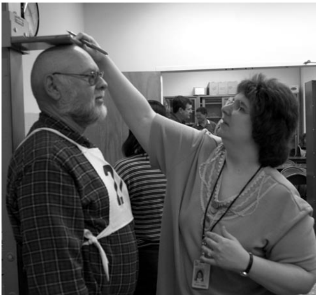
Figure 7. Male subject's height is documented.