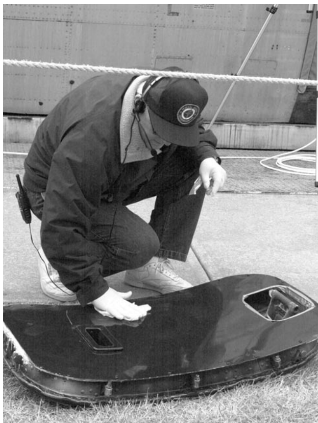
Figure 21. Safety officer decontaminates bloody hatch.

understanding injuries associated with evacuation research and the variables that can cause or reduce injuries. Development of this type of classification system and associated database can also improve compliance with reporting requirements necessary for conducting research using human subjects. Furthermore, the careful definition of injury patterns associated with evacuation studies can be extremely useful in the medical response planning phases of research protocols. Knowing the type of injuries to expect may provide cost-effective procedures for enhancing subject safety by ensuring appropriate preventive and response measures.