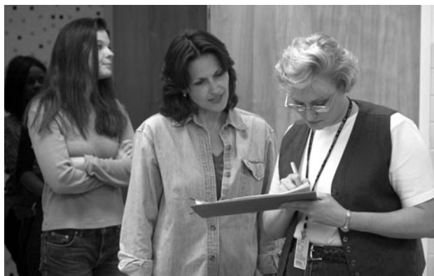
Figure 2. Each subject's name was checked against the registration roster for clearance.