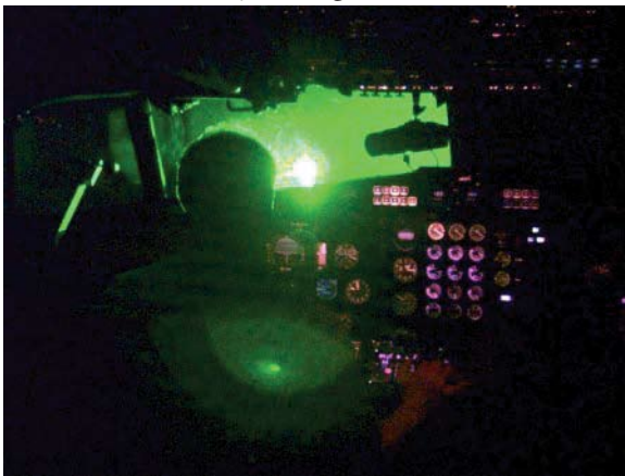
Figure 2: Cockpit glare induced by a 532 nm laser exposure ( 50 \mu\text{W}/\text{cm}^2 ).

Exposure to light that is several orders of magnitude brighter than that to which the eyes are adapted can reduce or eliminate a pilot's ability to correctly perceive depth or clearly see obstacles and the terrain (Figure 2). The period of time and extent to which these effects may last varies considerably among individuals.