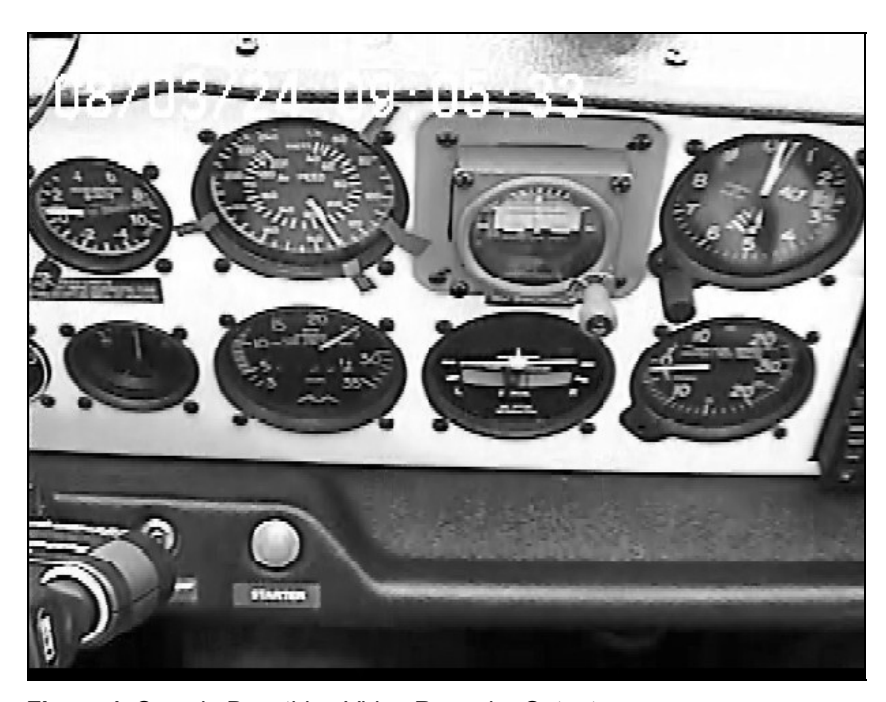
Figure 1. Sample Decathlon Video Recorder Output