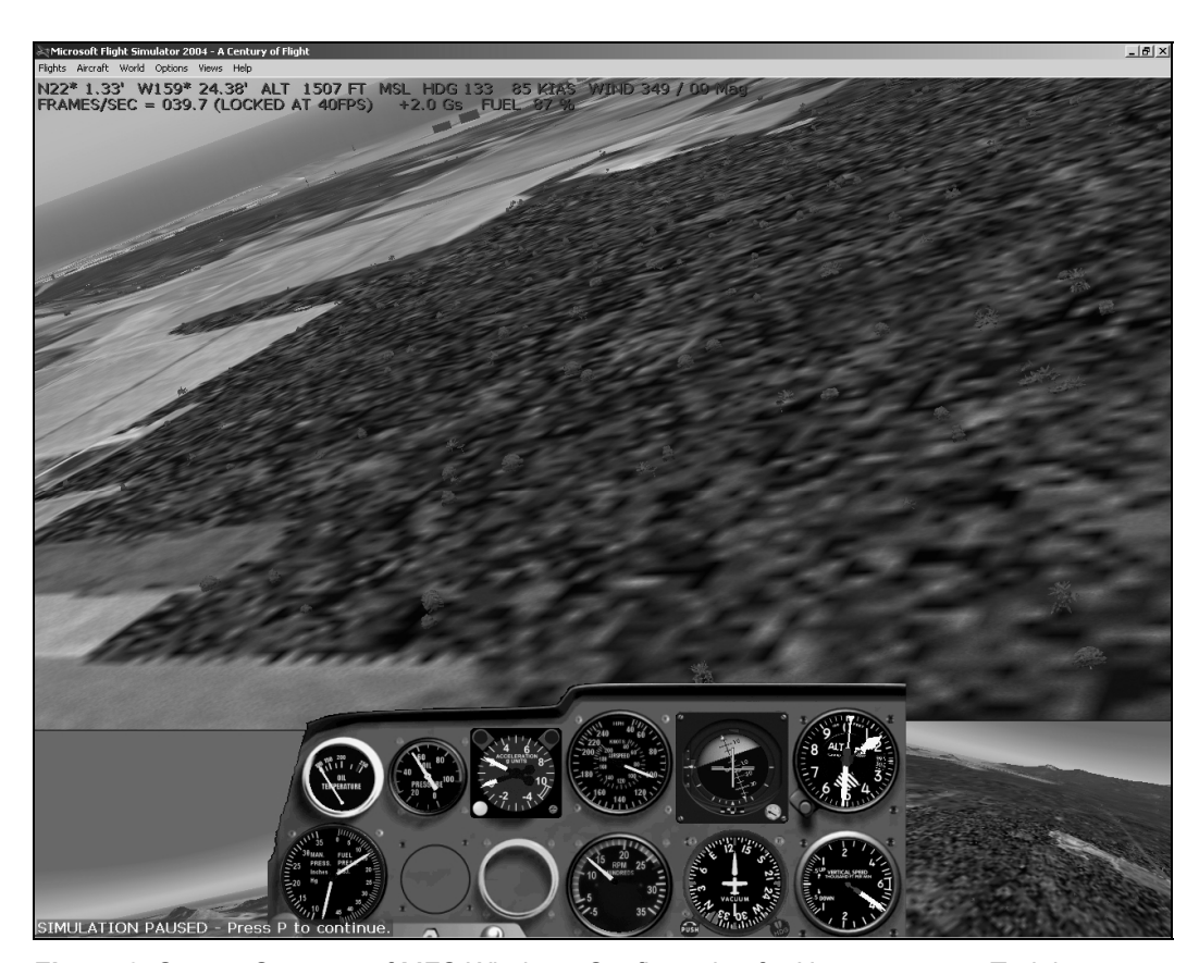
Figure 3. Screen Captures of MFS Windows Configuration for Upset-recovery Training

It appears that rote responses in upset-recovery maneuvering can be taught as effectively with MFS as with the motion based GL2000 simulator. The first of these responses involves using visual cues to determine pitch and bank angles during an upset. As shown in Figure 3, MFS, as implemented at ERAU, provides three simultaneous views outside the cockpit: 90° left, forward, and 90° right. The forward view is used to categorize an upset as nose-high or nose-low, while the two side views allow a pilot to determine bank angle, including whether the aircraft is upright or inverted. The second rote response is proper use of throttle—application of full thrust in nosehigh upsets and reduction of throttle to idle in nose-low upsets. It is possible that participant pilots might have been better prepared for GL2000 training had they previously practiced these rote responses on MFS or received more GL2000 no-motion practice. Repetition is a powerful learning reinforcement for such responses.