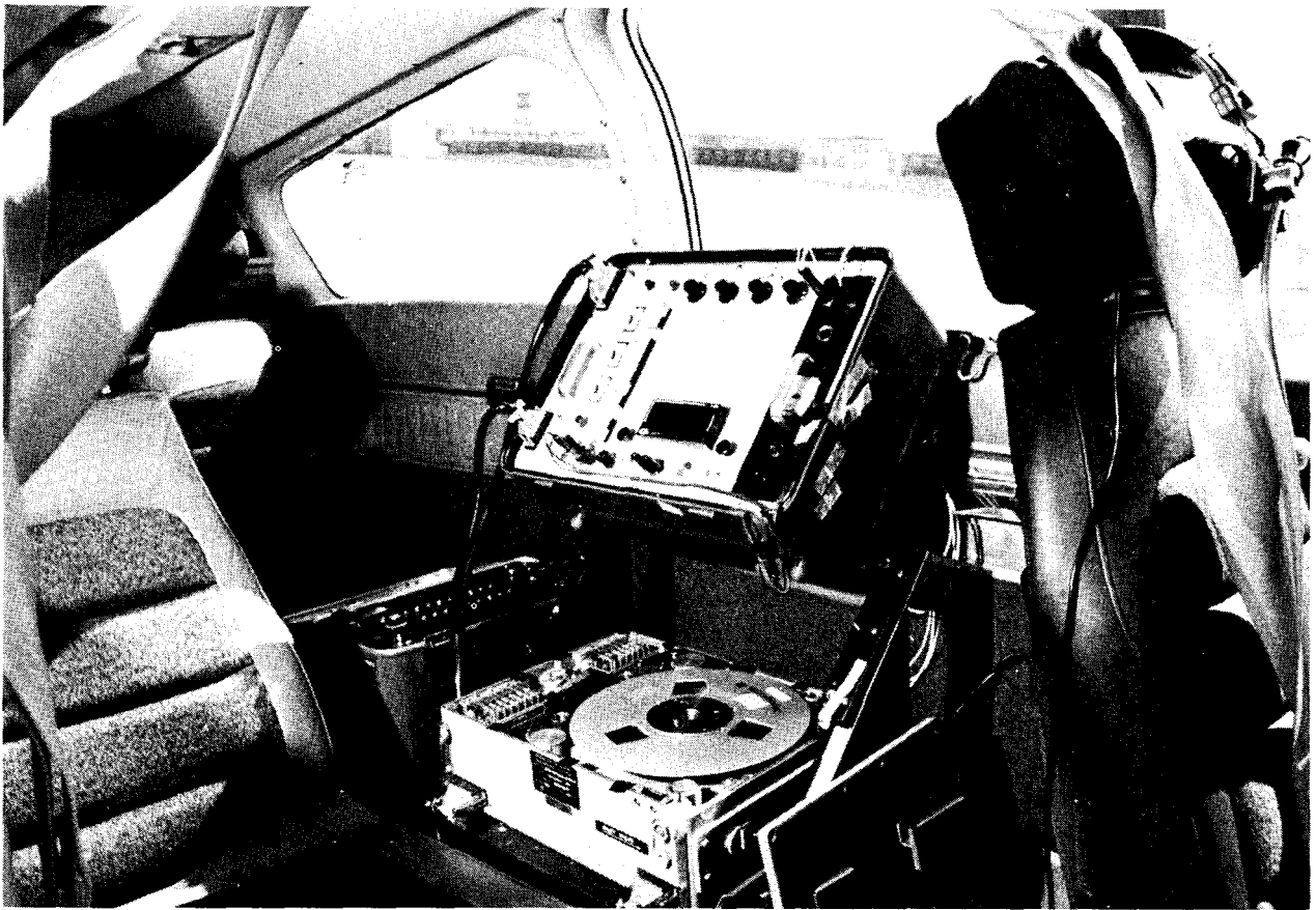
FIGURE 4. Data acquisition system and signal sampling and conditioning units installed behind pilot's seat.

The altimeter (G, Figure 1) consisted of a horizontal case containing electronically activated Nixie tubes to provide digital information. The instrument, located directly above the attitude indicator, was placed so that the altimeter would be in the pilot's line of sight as he looked for the runway after breaking out below clouds. The vertical distance from the top of the altimeter to the bottom of the heading indicator was 8 inches.