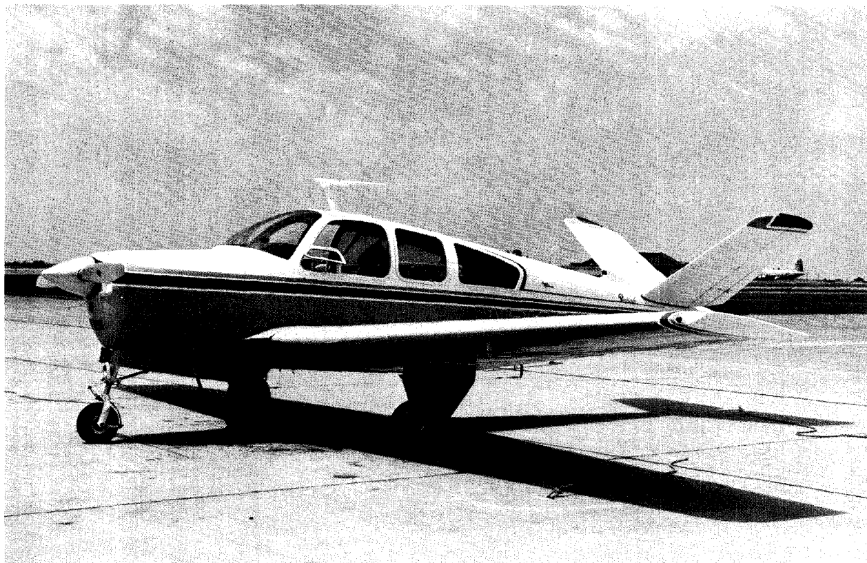
FIGURE 2. Beechcraft Bonanza 35A used in peripheral vision flight display study.

The heading indicator (F, Figure 1), placed immediately below the localizer instrument, consisted of a horizontal case with a lubber line in the center and a moving, servoed tape imprinted with heading numerals. An adjustable moving black pointer indicated deviation away from a desired heading preset at the lubber line and also showed which way the pilot should turn to correct his heading.