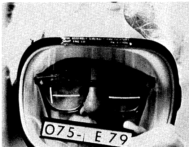
FIGURE 4b. Photograph of test subject wearing fullface device with spectacles displaced downward.

Experiments with pilots have demonstrated that binocular vision is not necessary for proficient landing performance. Lewis et al. 2 reported that monocular occlusion of low-time pilots during the approach phase has no effect on landing performance. Landing performance was measured by the proximity of the touchdown point to a fixed target on the runway. The authors confirmed similar results compiled by Lewis and Krier, 3 who studied NASA pilots and reported no impairment of landing performance following the sudden loss of binocular vision. Whether monocular occlusion can be equated to the alteration in stereopsis caused by the characteristics of the facepiece of a smoke-protective device is not known.