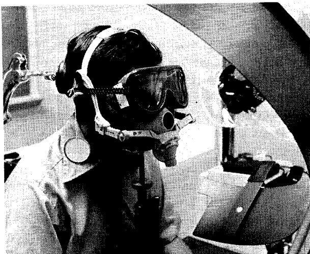
FIGURE 2. Subject wearing goggles/oxygen mask combination; wear angle is marked by two points on a card attached to the side of the goggles.

The wear angle of each test item is the angle between the frontal plane of the head and the transparent facepiece. This plane was recorded by marking two points along a plumbline—one on the upper part and the other on the lower part of a card attached to the test item, as shown in Figure 2. The head could then be repositioned in the Frankfort Plane by realigning the two points on the card with the plumbline.