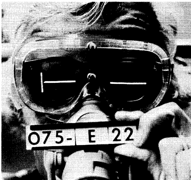
FIGURE 4a. Photograph of test subject wearing goggles/oxygen mask combination with spectacles displaced upward.