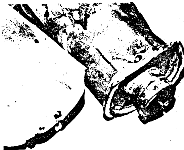
Figure 1. Muffler from a single engine aircraft. Note the split in the muffler and the discoloration caused by exhaust gases as they contacted the wall of the cabin heat exchanger shroud. The pilot was incapacitated in flight by carbon monoxide and killed in the crash that followed.

Case 2. The pilot, the only occupant of a Piper TriPacer, departed a local airport at 1700 on a cold December afternoon for the purpose of practicing touch-and-go procedures. The flight before the fatal accident was of 30-minutes' duration. The crash occurred in a wooded area adjacent to a large open field. The plane descended into the trees at a shallow angle paralleling the border of the open field. No autopsy was performed on the pilot but blood was submitted for toxicological analysis. A carboxyhemoglobin level of 23 percent was found. The pilot had been thrown free of the burned aircraft and gross injuries suggested that he died immediately after the crash. The finding of an elevated CO saturation prompted close inspection of the exhaust and heater system. Investigators found a cracked exhaust muffler and staining of the heat exchange shroud by the exhaust gases (Figure 1). The