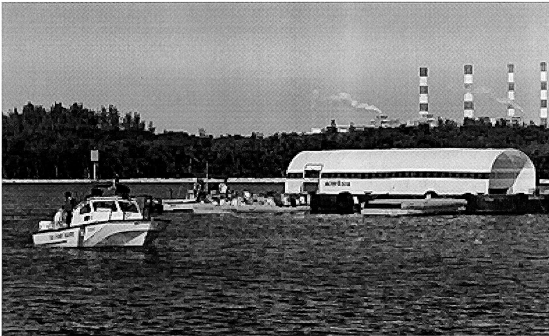
FIGURE 3 EMERGENCY DISASTER DRILL