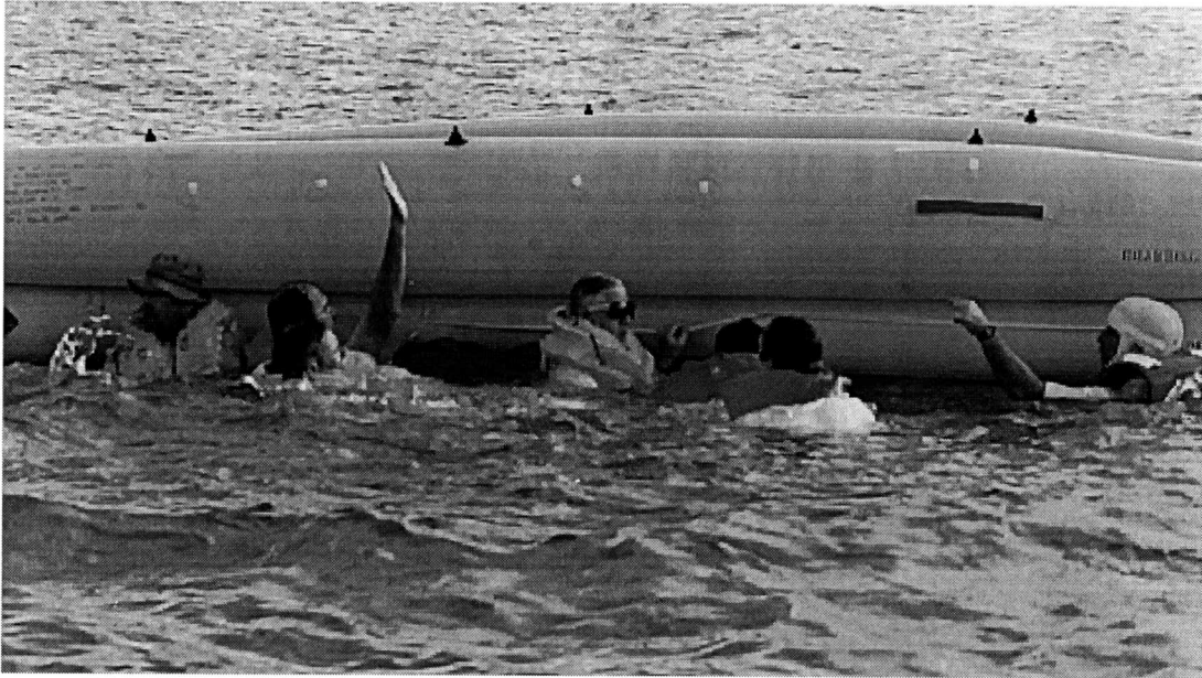
FIGURE 4 OPEN WATER EXERCISE