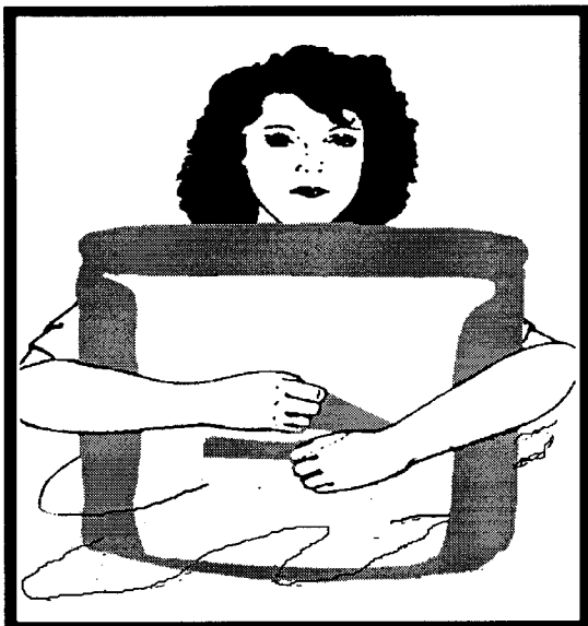
FIGURE 1 Vertical Flotation