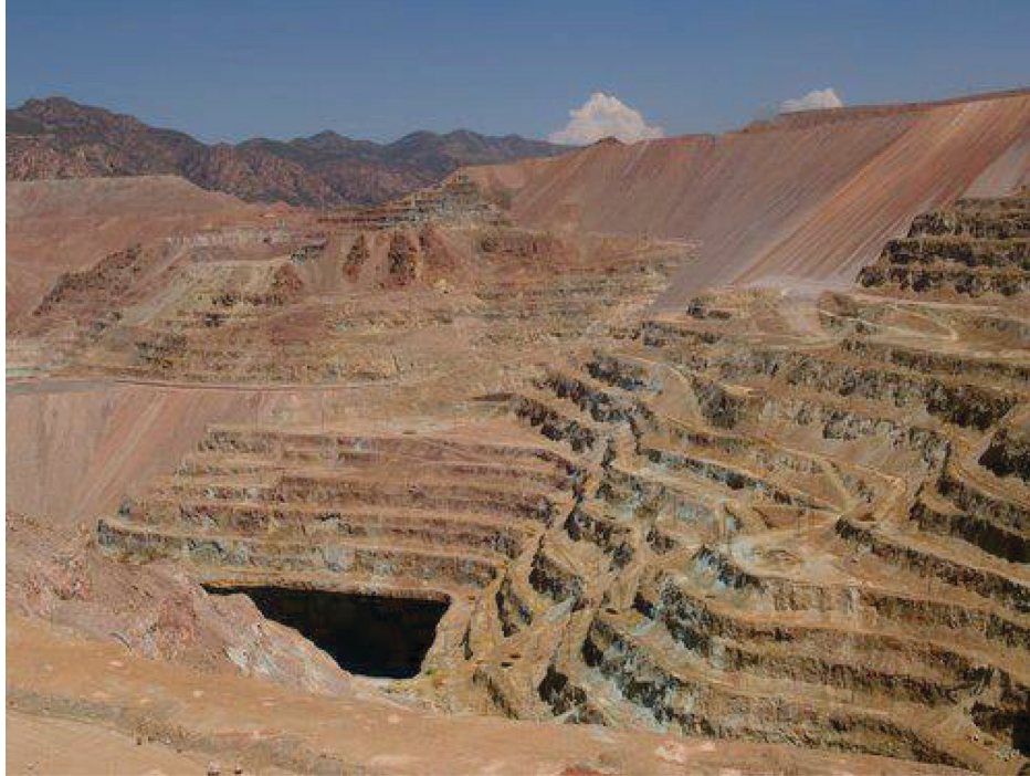
Figure 4: Morenci Mine