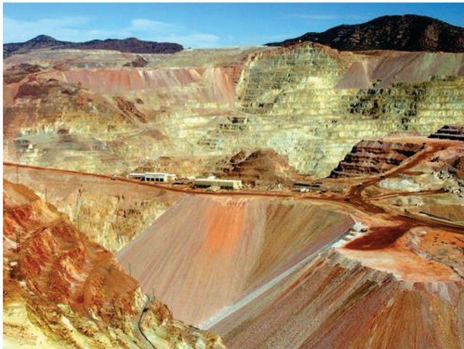
Figure 5: Morenci Mine