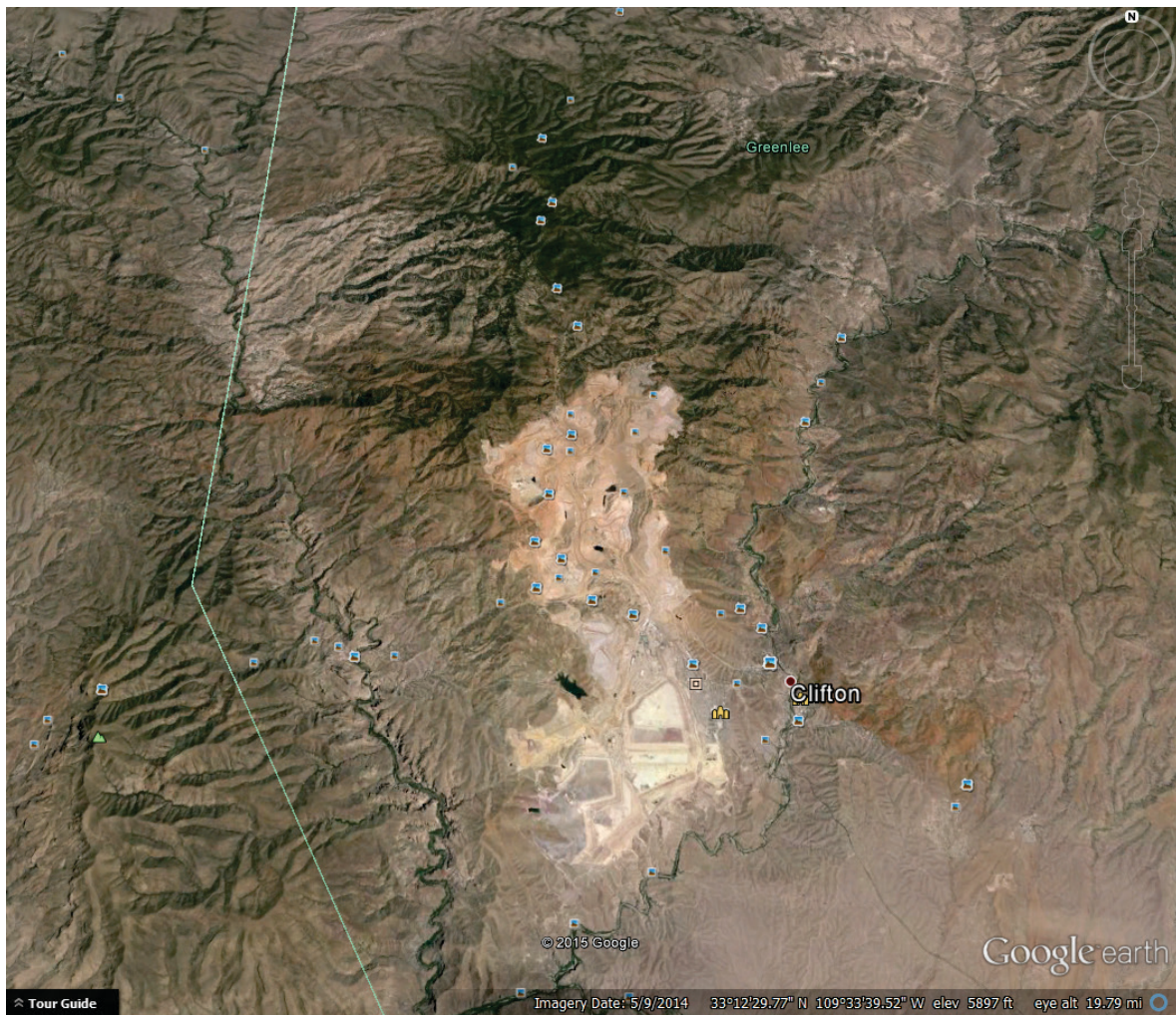
Figure 1: Google Earth image of Morenci Mine

Grant County Airport – in Silver City, New Mexico. The mine is located approximately 10 miles from Greenlee County Airport, which averages about 21 aircraft operations a week. 4