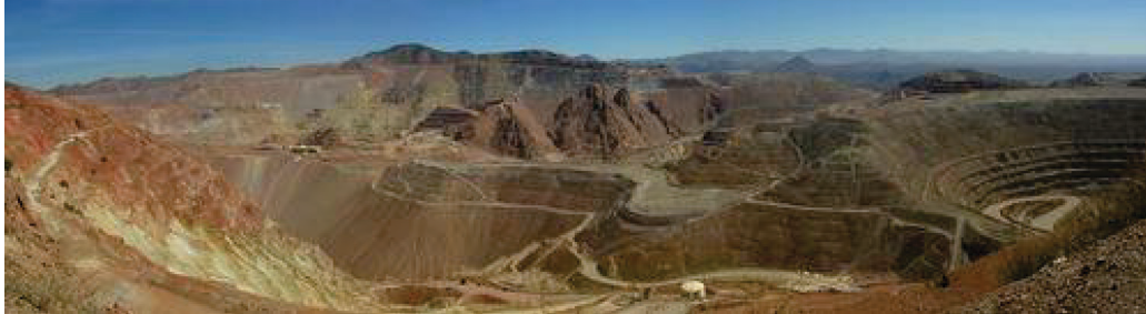
Figure 2: Morenci Mine