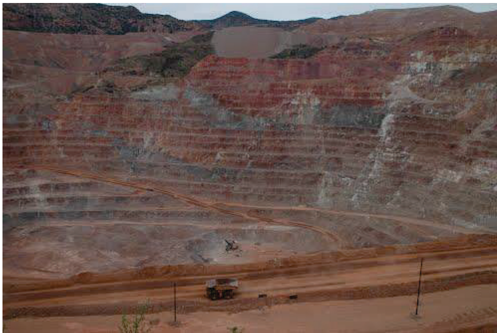
Figure 3: Morenci Mine – Each bench is approximately 50 ft