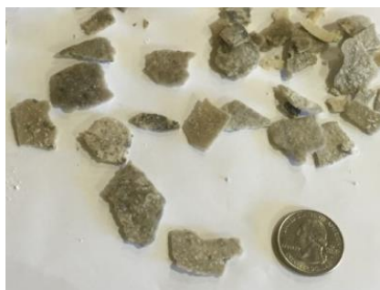
Actual pieces of crystallized particulates