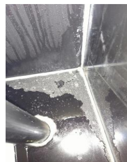
Drained AFFF tank