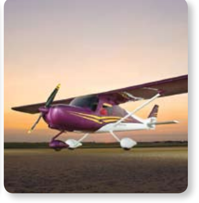
U.S. Department of Transportation Federal Aviation Administration