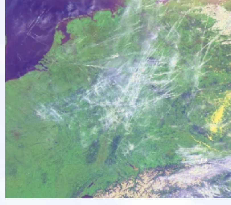
Figure 5. Satellite photograph showing an example of contrails covering central Europe on May 4, 1995. The average cover in a photograph is estimated by using a computer to recognize and measure individual contrails over geographical regions of known size. Photograph from the National Oceanic and Atmospheric Administration (NOAA)-12 AVHRR satellite and processed by DLR (adapted from Mannstein et al., 1999). (Reproduced with permission of DLR.)

ontrail cover is expected to change in the future if changes occur in key factors that affect contrail formation and evolution. These key factors include aircraft engine technologies that affect emissions and conditions in the exhaust plume; amounts and locations of air traffic; and background atmospheric humidity conditions. Changes in engine fuel efficiency, for example, might change the amount of heat and water emitted in the exhaust plume, thereby affecting the frequency and geographical cover of contrails. Changes in air