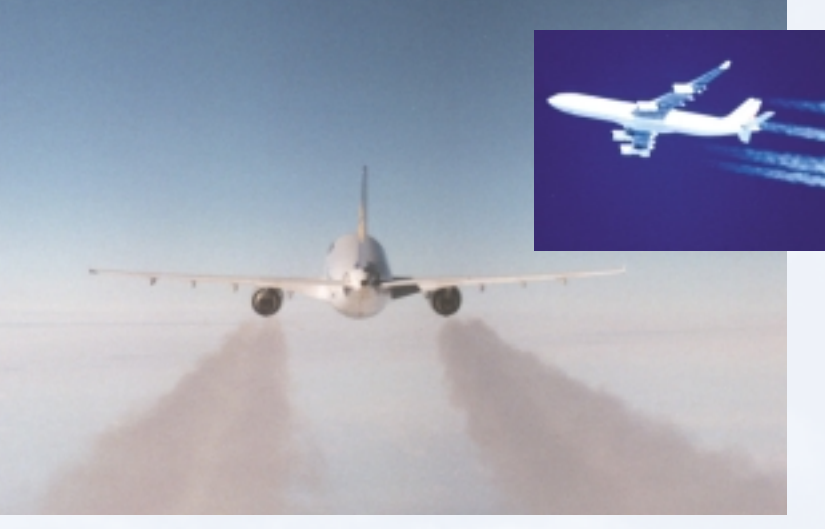
Figure 1. Contrails forming behind the engines of a Lufthansa Airbus A310-330 cruising at an altitude of 35,100 ft (10.7 km) as seen from research aircraft. Inset: Contrails forming behind the engines of a large commercial aircraft. Typically, contrails become visible within roughly a wingspan distance behind the aircraft.