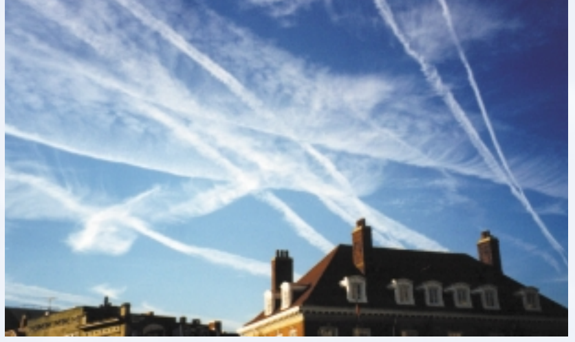
Figure 3. Persistent contrails and contrails evolving and spreading into cirrus clouds. Here, the humidity of the atmosphere is high, and the contrail ice particles continue to grow by taking up water from the surrounding atmosphere. These contrails extend for large distances and may last for hours. On other days when atmospheric humidity is lower, the same aircraft passages might have left few or even no contrails.

might freeze to form ice particles that compose a contrail. Enough particles are present in the surrounding atmosphere, however, that particles from the engine are not required for contrail formation. There are no lead or ethylene dibromide additives in jet fuel. Additives currently used in jet fuels are all organic compounds that may also contain a small fraction of sulfur or nitrogen.