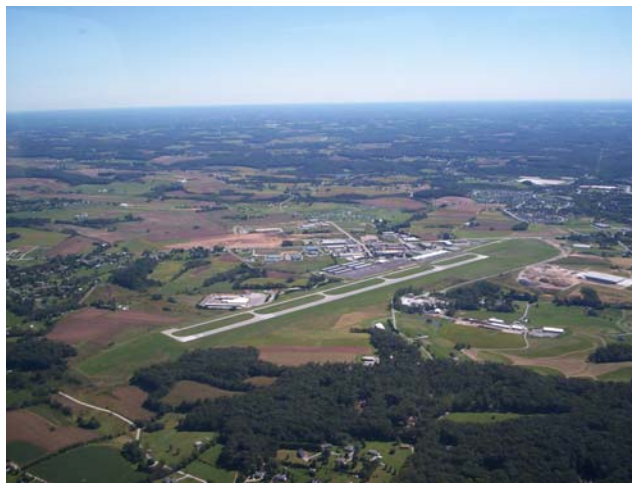
Every flight offers its own unique training opportunities.

Finally, phase III takes the previously discussed hazards, risks, and considerations, and scripts them into a complex scenario. This forces the student to consider not only a