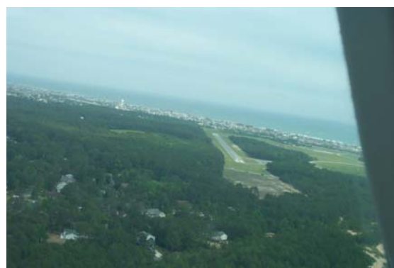
Each aeronautical activity poses its own unique challenges.

To achieve this end, we must not only understand what it means to be safe, but also the system that provides a framework for our discussion. In aviation, the term “system” is intended to address every element of a flight operation from conception to completion; from the time the flight planning begins to the time you leave the airport after reaching your destination. A system involves the mechanic who maintains your aircraft and the