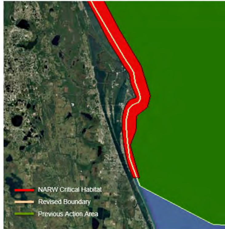
Figure 3. NARW Critical Habitat with Previous and Revised Atlantic Ocean Action Area

The Federal Aviation Administration (FAA) requests your review and, if appropriate, written concurrence that these revisions will not adversely affect any species listed or proposed for listing under the Endangered Species Act or any designated or proposed critical habitats beyond those effects already evaluated in the 2025 NMFS BCO.