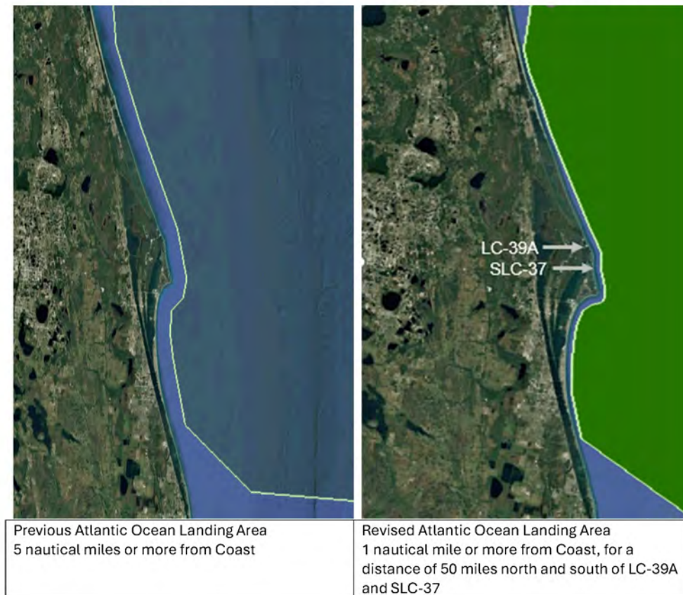
Figure 2. Comparison of Previous and Revised Atlantic Ocean Action Area