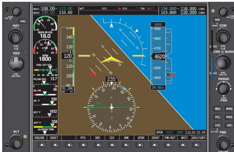
▶ Current procedure