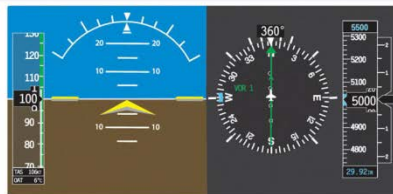
After procedure ▶