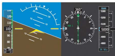
◀ Before procedure